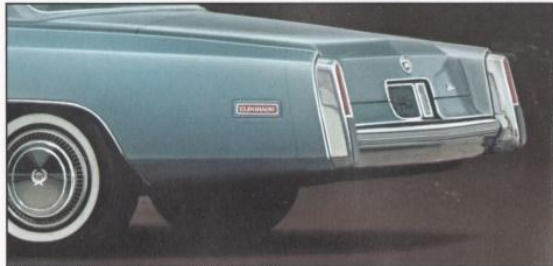
New Side Marker Lights and Vertical Tail Lamps.