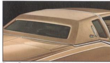
Elegant French seam roof/window treatment.