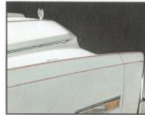
Distinctive spear-like design.

Eldorado's appeal takes on a special dimension in this... the Eldorado Custom Biarritz by Cadillac. It's distinctive.