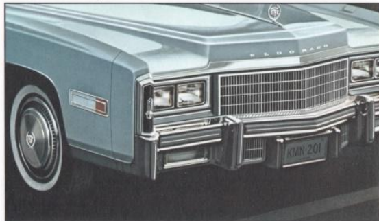
Cornering Lights. Bumper Impact Strips.