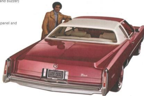
Litho in U.S.A.

CADILLAC MOTOR CAR DIVISION GENERAL MOTORS CORPORATION