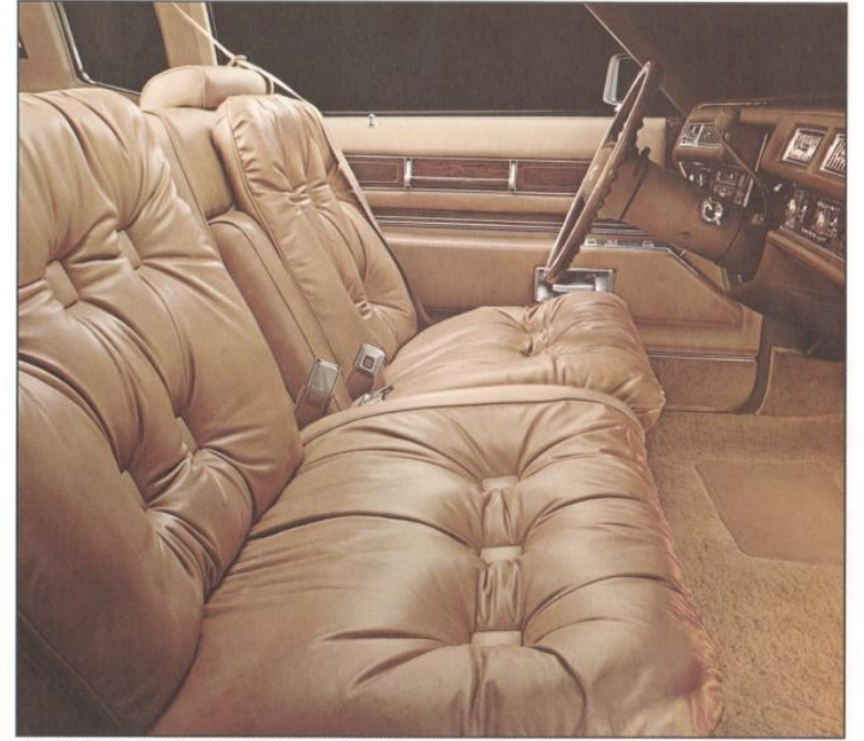
Another Biarritz feature—Cadillac Contoured Pillow Style Seating. Shown in Antique Light Buckskin.