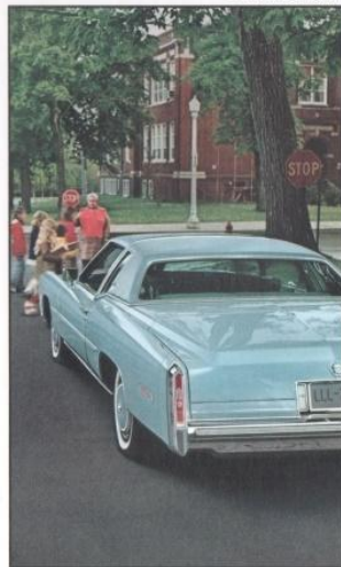
Four-Wheel Disc Brakes.