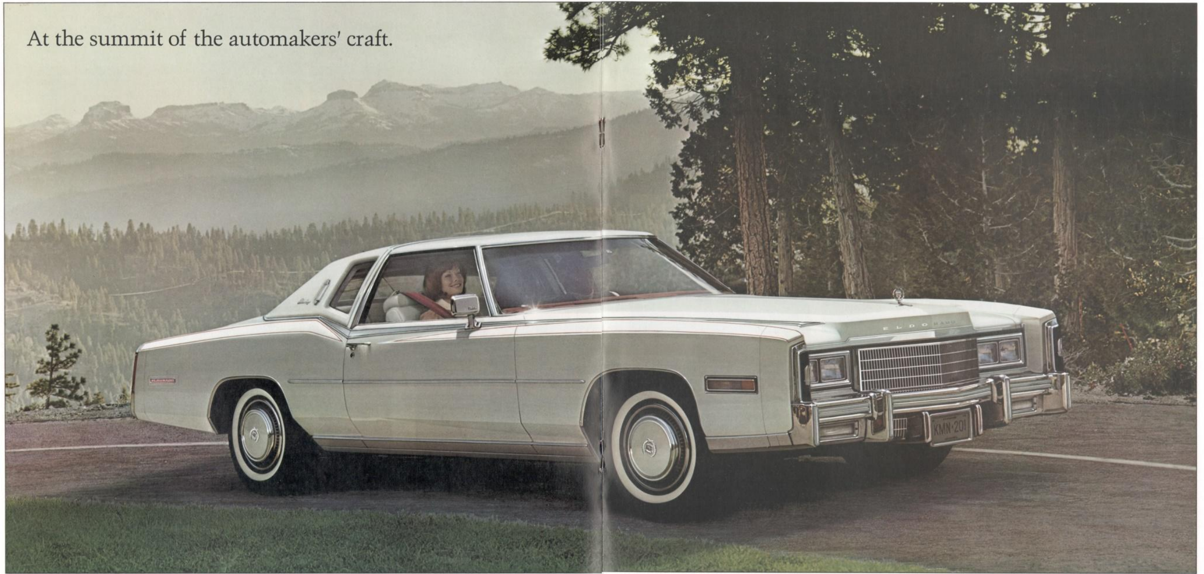
Eldorado Custom Biarritz in Cotillion White with padded White vinyl top.