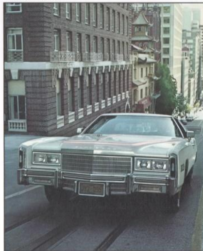
Bold New Grille.