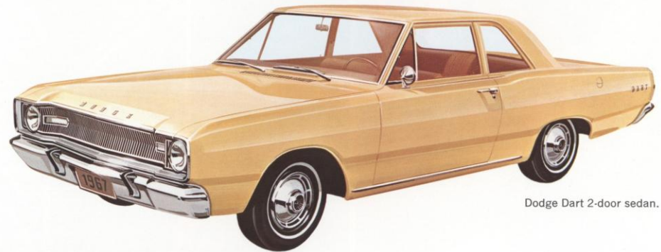
Dodge Dart 2-door sedan.

All-vinyl Dart Series interior. Standard.