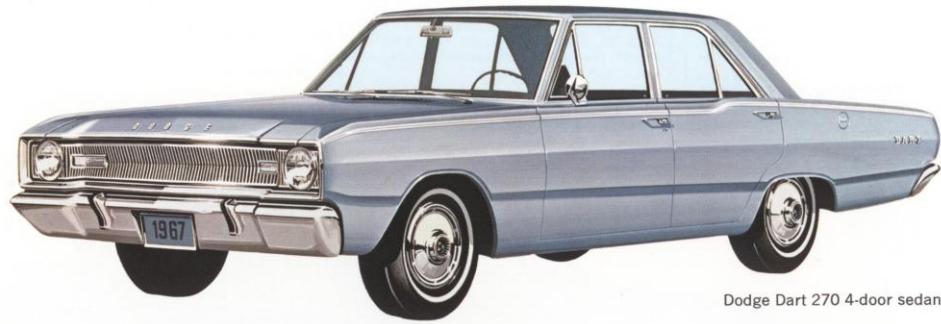
Dodge Dart 270 4-door sedan.