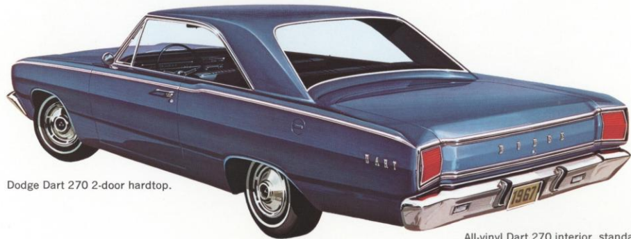
Dodge Dart 270 2-door hardtop.

All-vinyl Dart 270 interior, standard in hardtop; optional, at extra cost, in 4-door sedan.