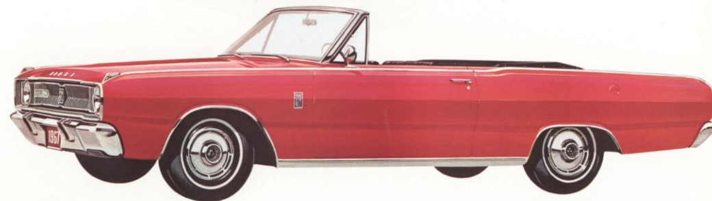
Dodge Dart GT convertible.

Dart GT convertible interior. Front bench seat (all-vinyl) is standard. Front bucket seats are optional, at extra cost, in convertible; standard in Dart GT hardtop.