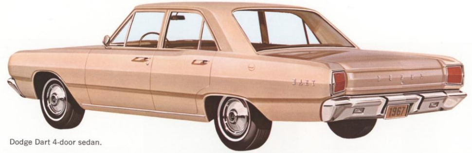
Dodge Dart 4-door sedan.