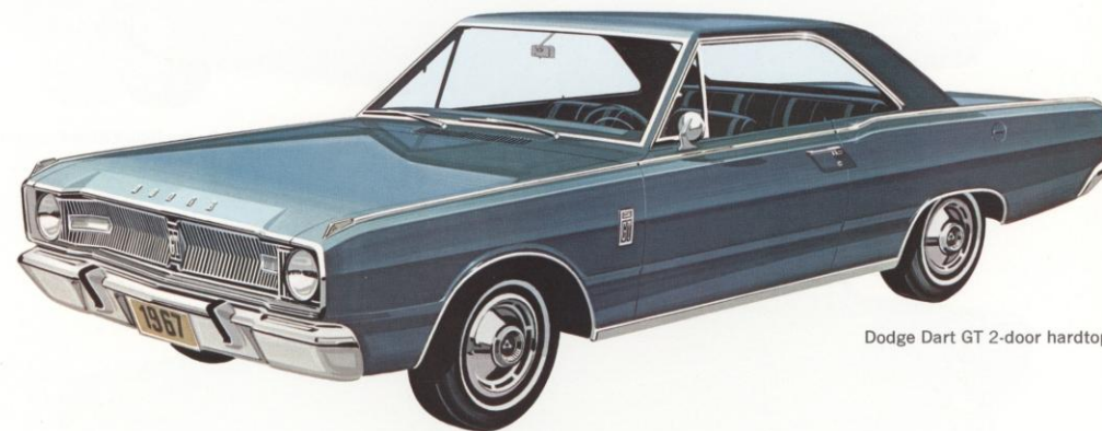
Dodge Dart GT 2-door hardtop.

major chassis lubrication (good for 36,000 miles) □ Curved and tempered side glass □ Convertible, flexible, air-tempered glass rear window □ Power convertible top with choice of black, blue or white material □ Front-fender-mounted turn signal indicator lights □ Standard safety equipment for Dart GT models is shown on back cover of this catalog.