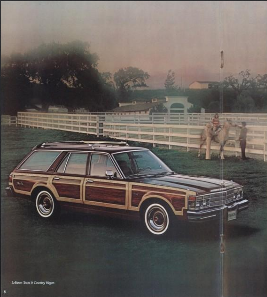
LeBaron Town & Country Wagon