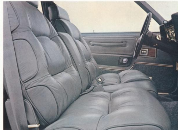
Optional leather-and-vinyl 60/40 seats have a fold-down armrest and passenger recliner. These seats are available on all Medallion models and the Town & Country.