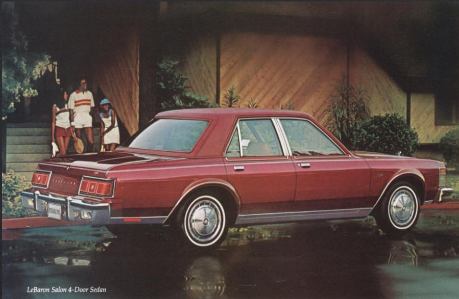
LeBaron Salon 4-Door Sedan