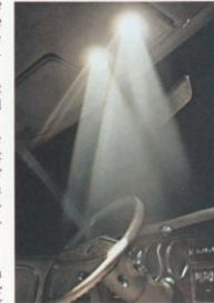
Front overhead reading lamps provide illumination.

The sportiest Medallion—the 2-door model. It has all the appearance of a responsive touring car... a personal car designed for youthful tastes.