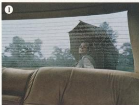
Electric rear window defroster.