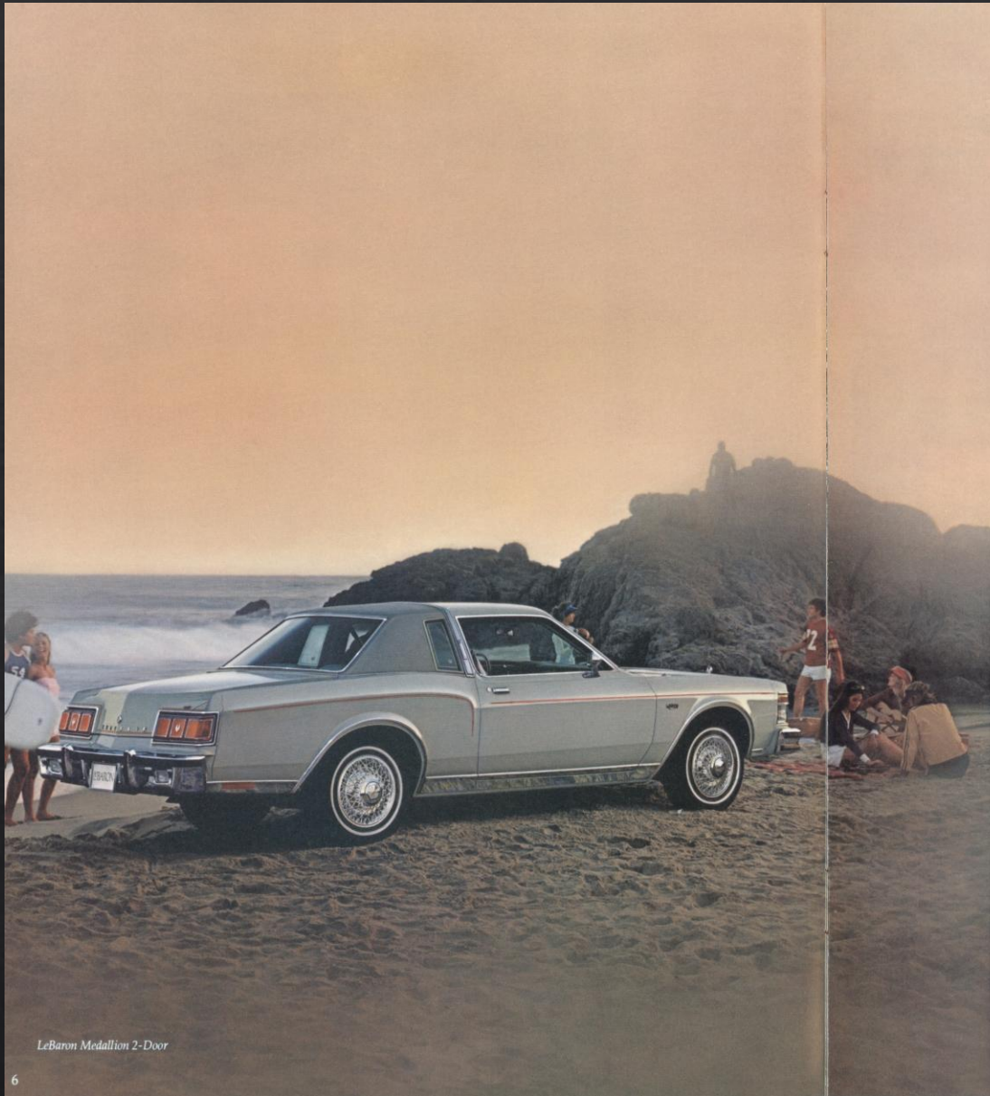
LeBaron Medallion 2-Door