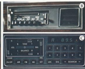
Air conditioning/ Electronic Search Tune AM/FM stereo radio.