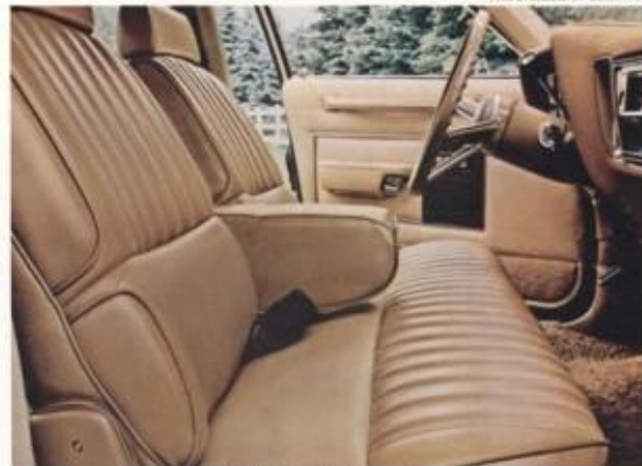
Supple all-ribbed split-back bench seat with center armrest is standard for Town & Country wagons. Available in teal green, red or cashmere. (Optional in Sedan models.)