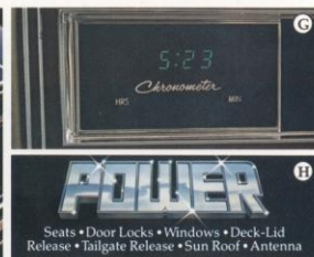
Electronic digital clock/ Power-assist options.