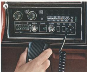
40-channel CB radio.