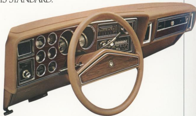
Functional and luxurious. That's the Medallion instrument panel. With simulated leather-grain finish instrument panel pad. A handy trip odometer. Elegant rosewood-like grain instrument cluster trim.