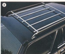
Station wagon air deflector and roof rack.