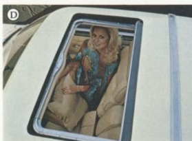
Power-operated tinted-glass sun roof.