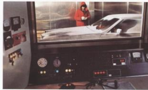
Effectiveness of Eldorado's new side window deloggers observed in Cadillac's Cold Room.