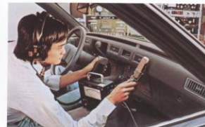
Finding and eliminating squeaks and rattles.

Total Cadillac Value. The value inherent in every 1979 Cadillac...when you buy it...when you drive it...and when you trade it is Total Cadillac Value. Cadillac 1979...an American standard for the world.