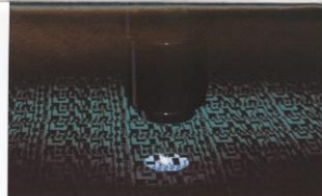
Laser trimming of Electronic Control Unit for Cadillac's exclusive Electronic-Fuel-Injected Engines.

With respect to extra cost optional equipment, make certain you specify the type of equipment you desire on your vehicle when ordering it from your dealer. Some options may be unavailable when your car is built. Your dealer receives advice regarding current availability of options. You may ask the dealer for this information. GM also requests the dealer to advise you if an option you ordered is unavailable. We suggest you verify that your car includes the optional equipment you ordered or, if there are changes, that they are acceptable to you.