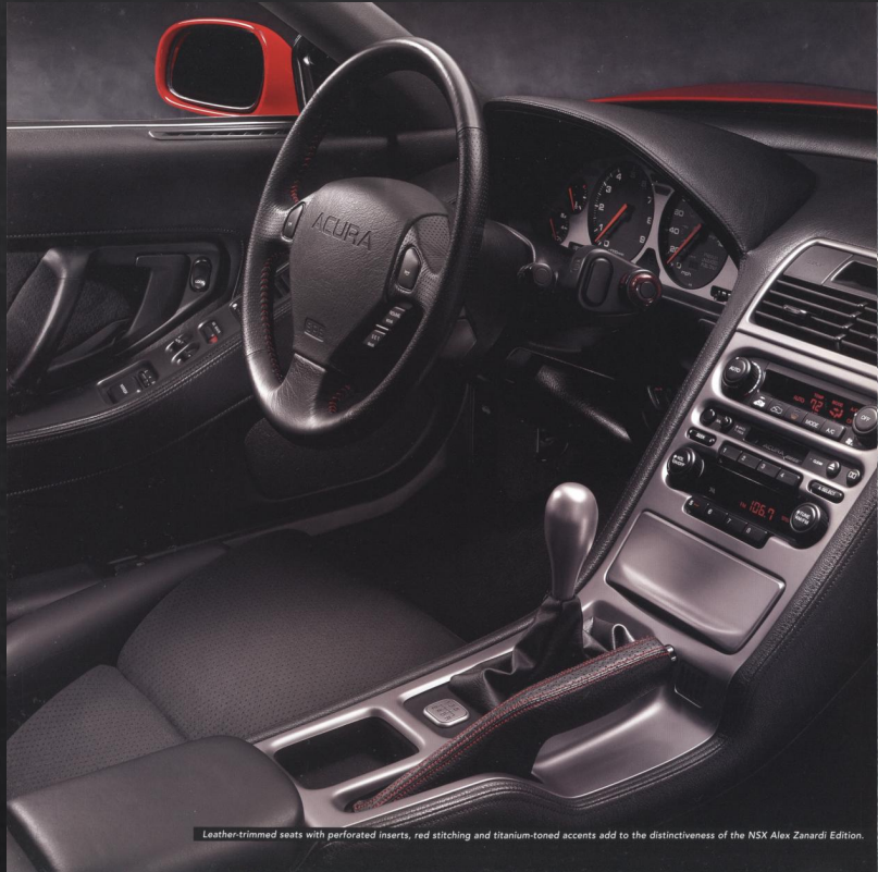
Leather-trimmed seats with perforated inserts, red stitching and titanium-toned accents add to the distinctiveness of the NSX Alex Zanardi Edition.