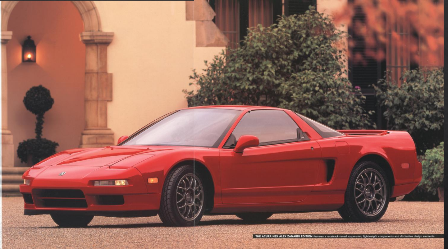
THE ACURA NSX ALEX ZANARDI EDITION features a racetrack-tuned suspension, lightweight components and distinctive design elements.