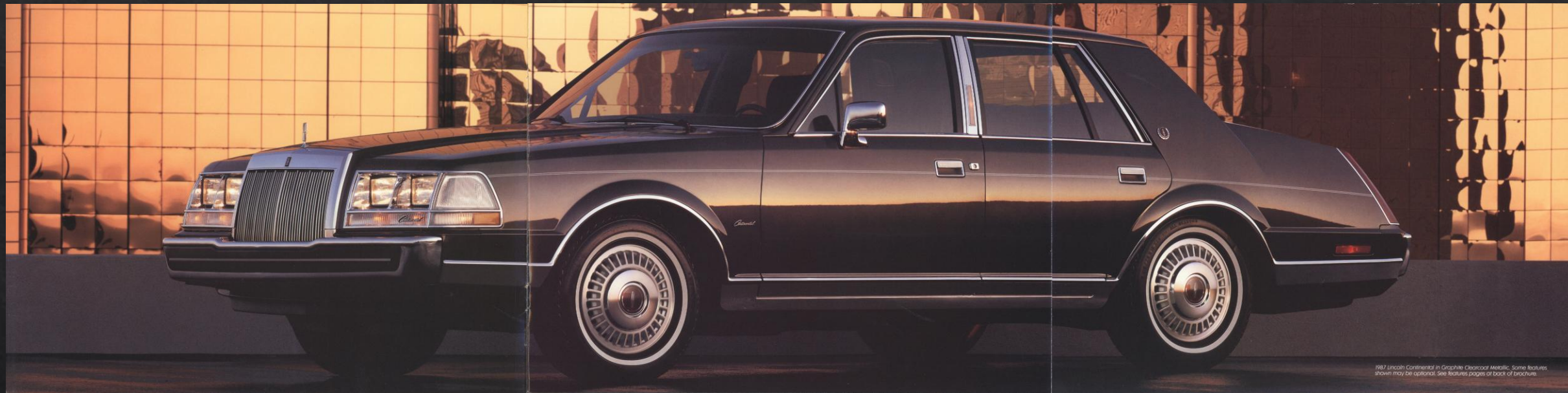
1987 Lincoln Continental in Graphite Clearcoat Metallic. Some features shown may be optional. See features pages at back of brochure.