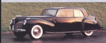
The 1941 Lincoln Continental. Among its refinements were push button door latches and electric windshield wipers.

1987 EPA estimates were not available at publishing time. Lincoln models, however, should earn extremely good mileage figures in the new EPA Gas Mileage Guide. See your dealer for the latest figures.