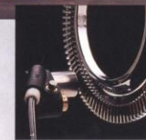
Continental's Anti-Lock Brake System begins with a speed sensor at each wheel that sends information to a microprocessor.