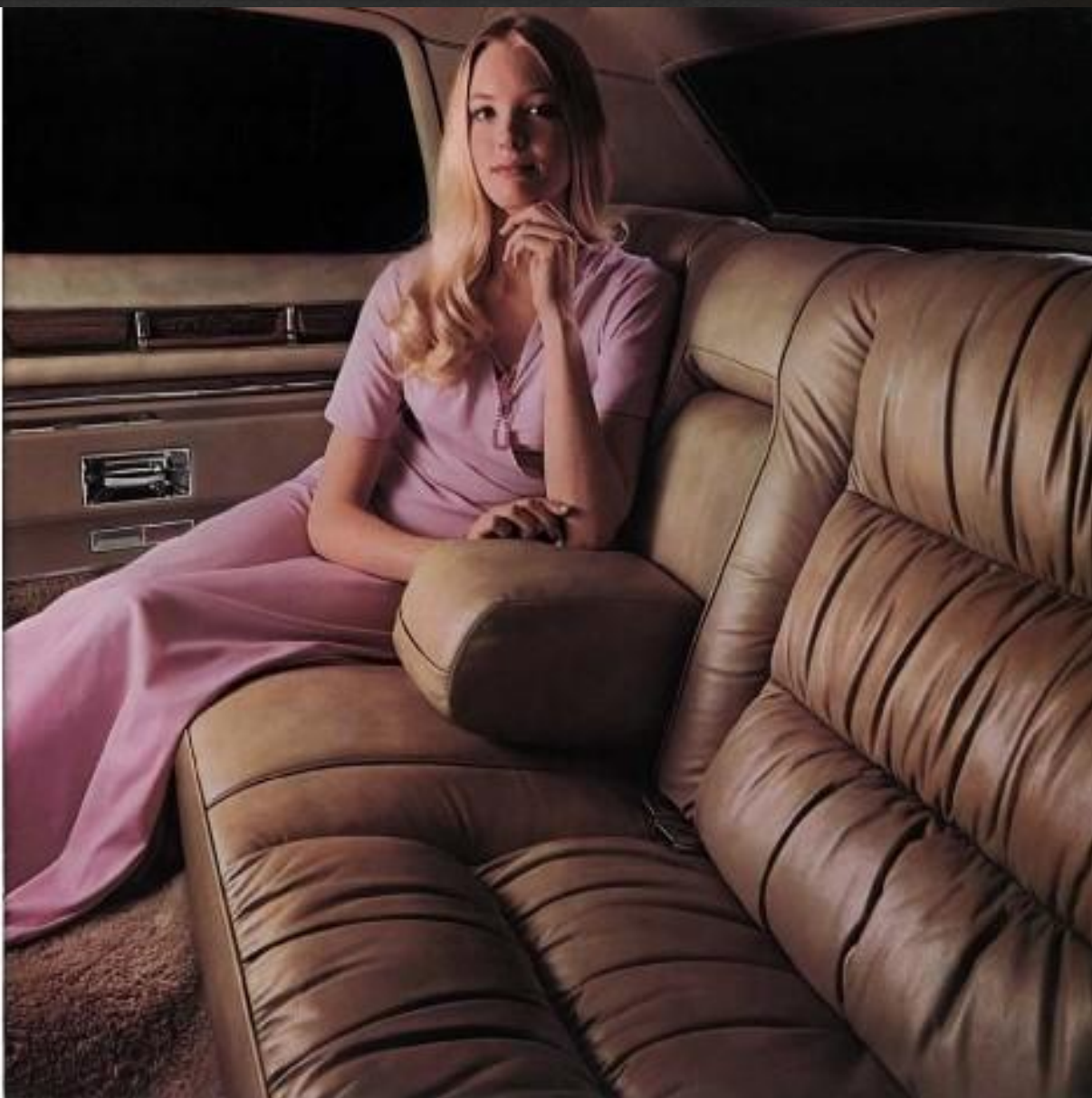
New color leather interior of the Fleetwood Brougham™

...the long-lasting value of Cadillac 1975 becomes increasingly apparent.