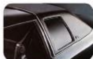
The Coupe DeVille Cabriolet features a dramatic vinyl roof design with a sheer chrome accent strip, as well as a stand-up see-through crest on the hood.