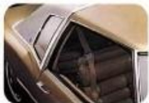
Featured is the Eldorado Coupe with Custom Cabriolet roof—available with or without an electrically operated sunroof or the new Astroroof.

Fleetwood Tallman. Webster defines Tallman as "something producing apparently magical or miraculous effects." So does Cadillac. Very simply, it is our ultimate in personalized luxury and comfort. Inside and out, the Fleetwood Tallman stands alone. Between the individual front seats is a fabric-trimmed console with both an illuminated and a lockable storage compartment. In addition, the front passenger seat features a reclining back and the rear seat has been made full size this year. Sculptured moldings accent the door inserts, and throughout the interior there is Medio-crushed velour, available in four colors—Gold, Rosewood, Black and Dark Blue (shown). Outside, the car features a padded elk grain vinyl roof, special wheel discs, a standup wreath and crest on the hood, and "Fleetwood Tallman" in script on the sail panel.