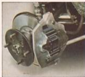
The single cylinder caliper front disc brake is fitted to all 1300 models and to those 1100 Mk II models equipped with automatic transmission.