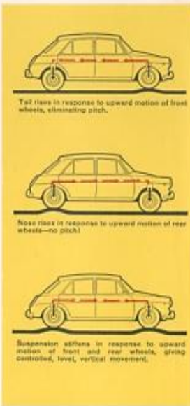
Tail rises in response to upward motion of front wheels, eliminating pitch.

The outstanding feature is its sheer simplicity of operation. The front and rear 'Hydrolastic' displacers on each side of the car are inter-connected by a small bore pipe. The system is hermetically sealed and therefore never needs any further attention during the normal working life of the car. Each displacer incorporates a 'rubber spring' and damping of the system is achieved by rubber valves so that when a road wheel is deflected, fluid is displaced to the corresponding suspension unit. In turn it is raised in anticipation of its wheel encountering the cause of its counterpart's deflection. The rubber springs are only slightly brought into play and the car is freed from any tendency to pitch although full play is given to wheel movement, producing a soft ride. When front and rear wheels encounter a simultaneous deflection the fluid suspension stiffens in response to the upward motion and while acting as a damping medium transfers the load to the rubber springs giving a controlled, vertical but level motion to the car. The restriction of the fluid flow, imposed by the small bore piping, rises with the speed of the car. The ride is therefore steadied at high speeds and softened at low speeds—a most satisfying condition hitherto only achieved by complex and costly means.