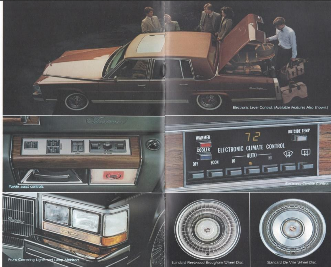
Electronic Level Control. (Available Features Also Shown.)

Bumper Guards—Front. Bumper Rub Strip—Front and Rear. Crest Ornamentation—including Hood, Deck Lid, Wheel Discs, Steering Wheel [De Villes only]. Door Sill Plates. Floor Carpet. Luggage Compartment—Carpeted. Moldings—including Body Side [Car Color], Rocker Panel, Wheel Opening. Roof, Metal, Painted [De Villes only]. Wheel Discs.