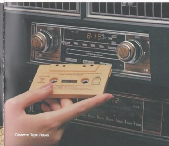
Cassette Tape Player