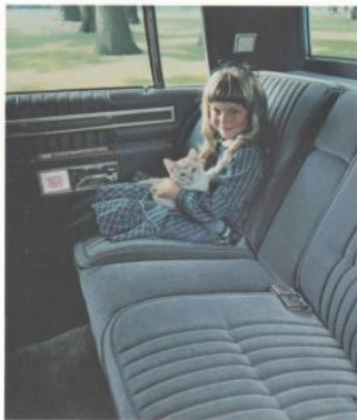
Let's Get It Together...Buckle Up.

AVAILABLE ANTI-THEFT FEATURE Theft-Deterrent System.