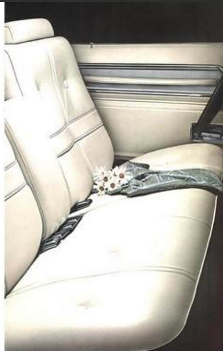
The rich, Sierra grain leather upholstery, shown in White, is dramatically set off with contrasting carpet and instrument panel. It is available in eleven other trim combinations.