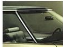
New rain-control pavilion (lower center) has been added to Cadillac's windshield wiper system. A single sweep removes mist and light rain deposits.