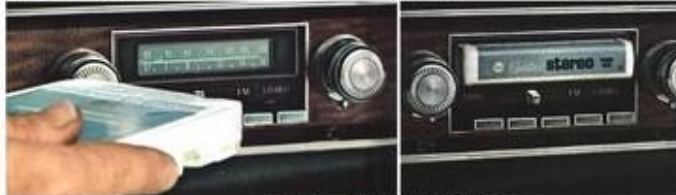
AM/FM Stereo Radio with Stereo Tape Player