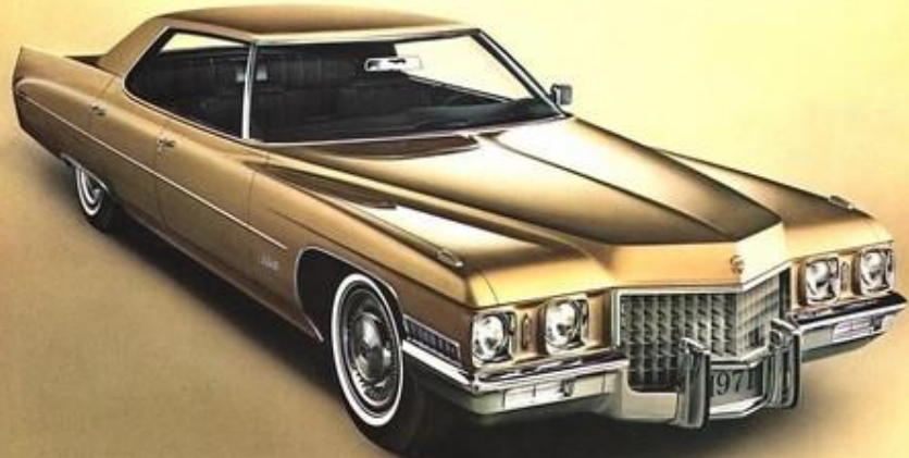
Calais Sedan in Darkest Gold