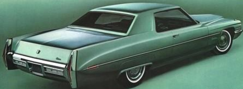
Calais Coupe in Adriatic Tealwood

The Calais is the easiest step to experiencing the pride and pleasure of Cadillac ownership. The brilliant new Cadillac styling and elegant interior appointments, the long wheelbase, the big Cadillac engine and increased-capacity brakes—these and other outstanding features mark the Calais as a true luxury car. And because Cadillac leadership goes beyond looks and performance, there's no stinting on conveniences. Features such as power windows, variable-ratio power steering, power front disc brakes, Turbo Hydra-matic transmission, front center armrest, electric clock, remote-control outside mirror, automatic parking brake release, the new inside hood release and a rear deck lid that you can unlock and open with one hand—all standard on Calais—usually cost extra, if available at all, on cars of lesser stature. And you can individualize your Calais with a wide variety of accessories, options and tasteful colors. All things considered—including original cost, economy of operation and long-lasting value—the Calais is certainly an extraordinary investment in luxury motoring.