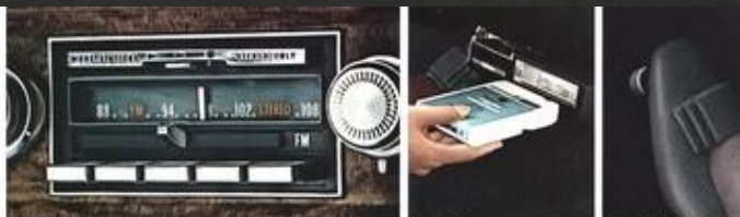
AM/FM Stereo Stereo Radio

Automatic Trim Controls. Helps keep car level, for best appearance and handling.