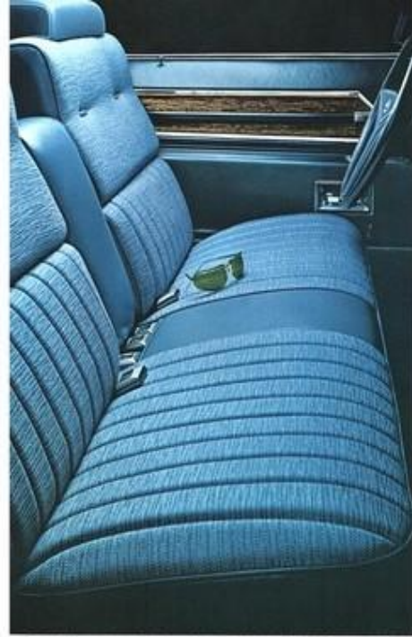
Dorado Cloth, a vertically ribbed luxury fabric, is available in the Eldorado Coupe in Medium Blue, as shown, and in Black, Dark Jade and Mocha.