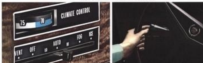
Automatic Climate Control