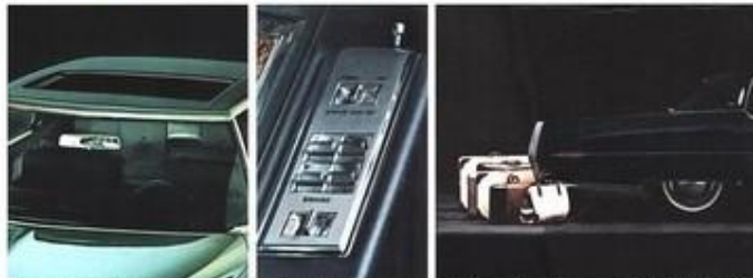
Electrically Operated Sunroof