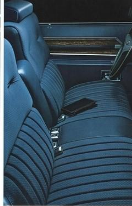
A smooth rich fabric, Dalton Cloth, makes a beautiful upholstery for the Eldorado Coupe. Shown in Dark Blue, you can also select Medium Aqua, Sage or Heather.