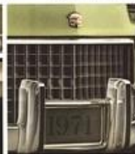
New front bumper's built-in vinyl guards offer greater impact and parking protection.