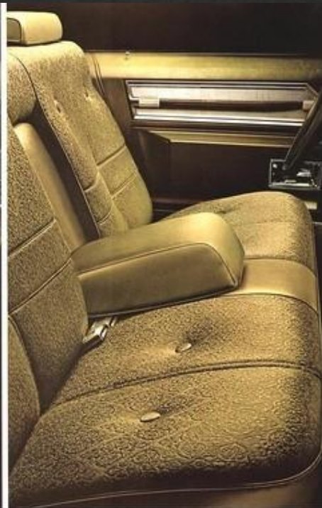
Luxurious Durbar Cloth, shown in Medium Marze, is also available in four other colors. Wide center armrests in both front and rear seats highlight Cadillac's many comfort features.