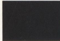
19. Starlight Black