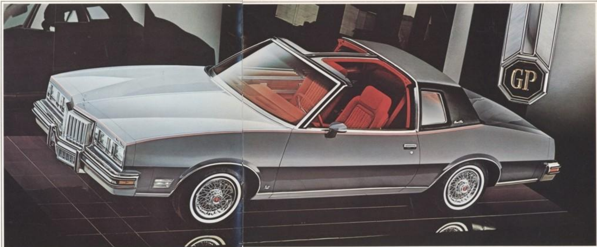
Some of the equipment shown or mentioned is optional at extra cost.