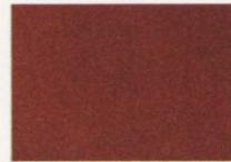
79. Claret Metallic