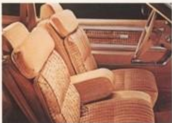
The loose-pillow look is standard on LJ. The 60/40 split is available.

The subtle richness of LJ's wide rocker moldings and body-colored mirrors are just a hint of all the attention to detail you'll encounter when you slip behind the luxury cushion wheel.