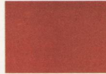
67. Ember Mist Metallic