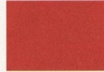
77. Carmine Metallic