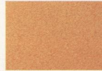
63. Laredo Brown Metallic