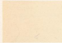
61. Desert Sand