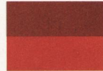
79. Claret 77. Carmine