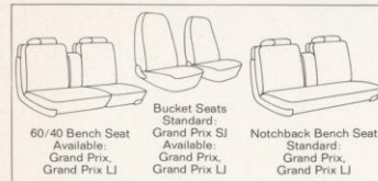
60/40 Bench Seat Available: Grand Prix, Grand Prix LJ