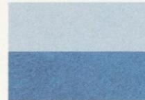
22. Glacier Blue 29. Nautilus Blue