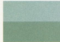
44. Seafoam Green 45. Mayfair Green