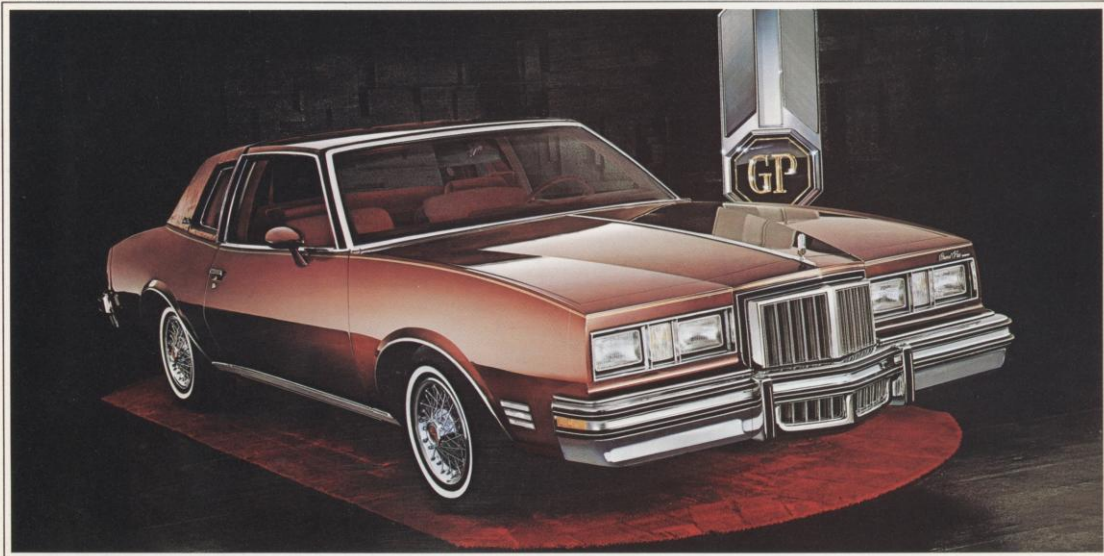
1978 Grand Prix. The one you'll never forget.

Some of the equipment shown or mentioned is optional at extra cost.