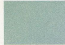
44. Seafoam Green Metallic