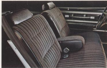
Grand Prix's standard notched-back full-width seat.