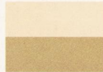
61. Desert Sand 56. Burnished Gold