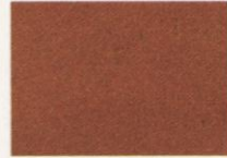
69. Chesterfield Brown Metallic