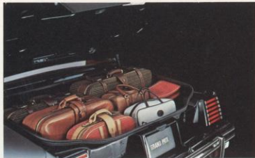
462 litres (16.3 cu. ft.) of trunk space.

Now you know how this new automobile has earned the Grand Prix name.