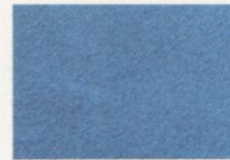
29. Nautilus Blue Metallic