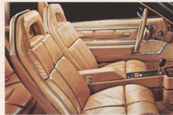
Viscount seats are real leather with vinyl holsters. Available on SJ and LJ models only.

Some of the equipment shown or mentioned is optional at extra cost.