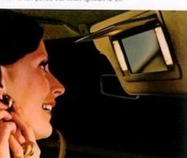
Lighted Vanity Mirror. Available on sun visors for both driver and passenger sides (passenger side only on Convertible). Raising the protective cover turns on lamps, one on each side of the mirror. Selector switch for high- or low-intensity light. Tilted, makes an excellent map light. Right-hand version is standard on Talisman.