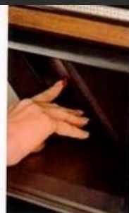
Automatic Trunk Lock Release. A control button inside the glove compartment releases the trunk lid. And when the lid is brought to a nearly closed position, the power trunk lock latches it securely again. There is also a warning light on the instrument panel to indicate when lid is unlocked.