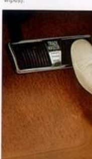
Track Master. This computerized skid-control system automatically pumps your brakes and maintains rear-wheel rotation for improved control during severe braking situations.