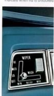
Controlled Cycle Wiper. New for 1974. Adjustable delayed action for light rain (up to 10-second intervals between wipes).