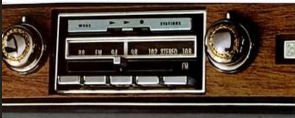
Signal Seeking Stereo Radio. This exclusive AM/FM model with four speakers and cross-fire design can seek out and find the available stereo radio stations for you. Your touch is its command, either by hand or with available dealer installed foot switch. (For the Fleetwood Seventy-Fives, Cadillac offers the signal-seeking stereo with control from the passenger compartment.) There's also an AM/FM pushbutton unit available, equipped with three monaural speakers—two front- and one rear-mounted.