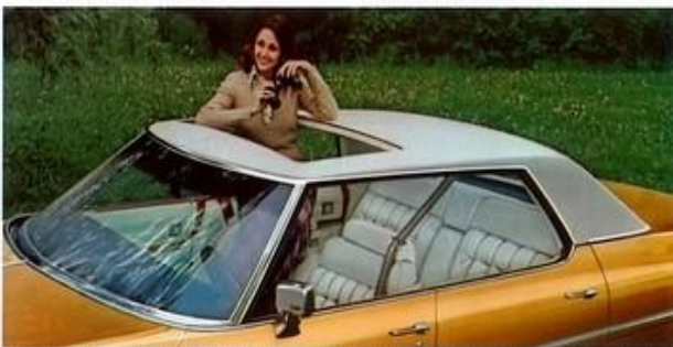
Electrically Operated Sunroof. Simply flick a control switch on the instrument panel, and a roof panel slides open overhead to let in the sunshine. It is available on the Fleetwood Brougham, on the Eldorado Coupe with vinyl roof and DeVilles with vinyl roofs, also Calais when vinyl roof is ordered.