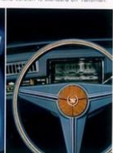
Fit and Telescope Wheel. This adjustable steering wheel can be tilted up or down and moved backward or forward to accommodate driver's height and reach. Swings up for easy entry and exit.