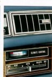
Automatic Climate Control. Set this heating/cooling/dehumidifying system to the temperature you want, and a hidden sensor controls it to help keep you comfortable.