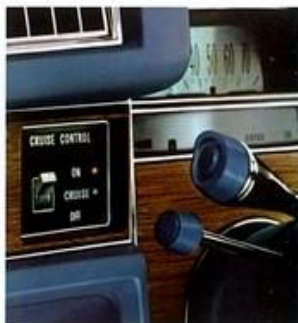
Cruise Control. A touch of this control at the lip of the directional turn signal lever allows you to maintain a selected speed without using the accelerator pedal. Unit automatically disengages when you apply brakes or turn off ignition.