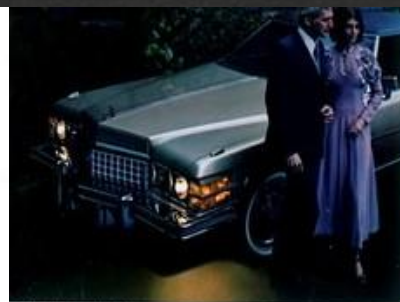
Twilight Sentinel. Automatically turns driving lights on or off in response to light conditions. Also lets you leave headlamps and either cornering lamp on to light your path from the car. Automatically turns them off. A reminder buzzer sounds if manual headlight switch is left pulled out when ignition is off.

Cadillac offers an inviting array of luxury features, equipment and accessories you can order to individualize the Cadillac of your choice . . . and to add to your motoring pleasure. No other luxury car can be more personally yours.