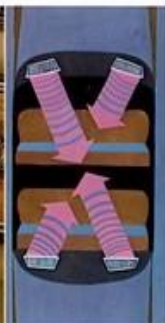
Stereo with Tape Deck. This AM/FM pushbutton stereo with integral 8-track tape player has set an exceptionally high standard of sound fidelity and styling for car radios. Its cross-fire design incorporates a total of four speakers, diagonally opposed within the passenger compartment, to give listeners a superb stereo effect. The speakers are positioned so that the windshield and rear window act as acoustic bandshells.