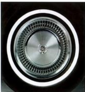
Special Wheel Disc. (Standard on the Fleetwood Brougham d'Elegance and Fleetwood Talisman.) Available on Fleetwood Brougham and Seventy-Fives. Also available (without wreath around Cadillac crest) on DeVilles and Calais.