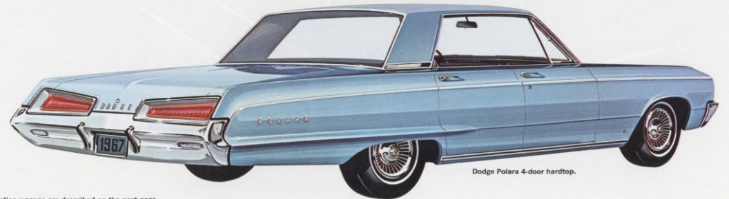
Dodge Polara 4-door hardtop.

Polara station wagons are described on the next page.