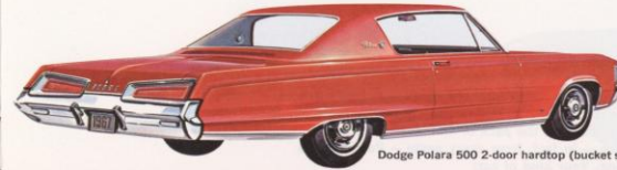
Dodge Polara 500 2-door hardtop (bucket seats).