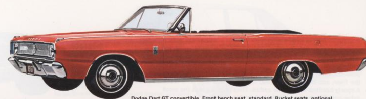
Dodge Dart GT convertible. Front bench seat, standard. Bucket seats, optional.

Dart strategy: dazzle you with good looks!