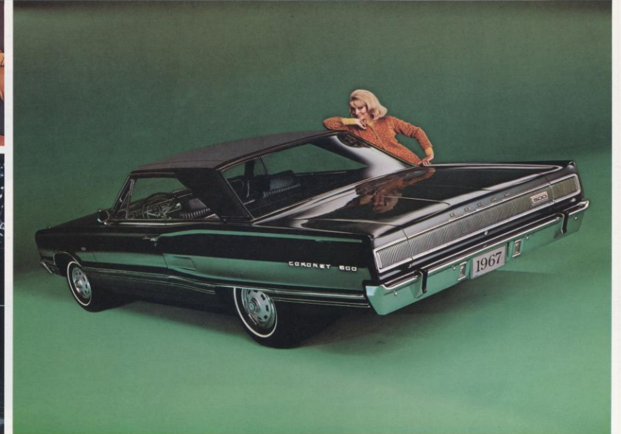
Dodge Coronet 500 2-door hardtop. Bucket seats, with choice of center cushion or console.