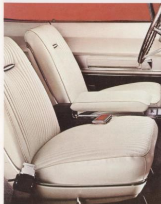
All-vinyl Charger® interior. *Center console (shown) or center cushion/pull-down armrest is optional, at extra cost.