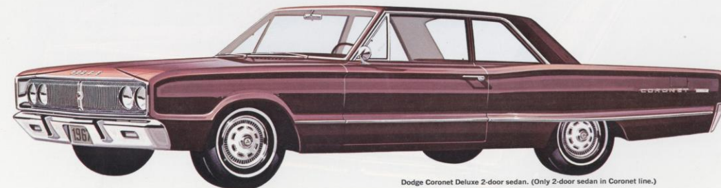
Dodge Coronet Deluxe 2-door sedan. (Only 2-door sedan in Coronet line.)

Coronet Deluxe 2-seat station wagon is shown on next page.