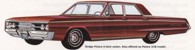
Dodge Polara 4-door sedan. Also offered as Polara 318 model.