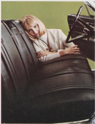
Monaco all-vinyl interior.