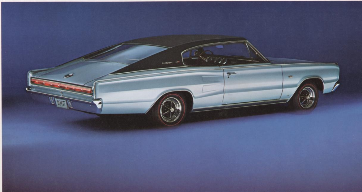
Dodge Charger 2-door fastback coupe, with fold-down rear bucket seats to provide 4-x-7½-foot rear cargo room.

Down with the idea that driving has to be dull! Move out — in Dodge Charger. It's America's only full-sized fastback. Distinctive. Debonair. With a sleek, devil-may-care look that suggests adventure. And Charger changes its personality to suit your moods. It's a swinging sports model (but family-sized). Charger carries four in stride. Hauls wagon-sized loads (with rear seats folded). Dodge Charger — sporty, good-looking luxury — that really works!