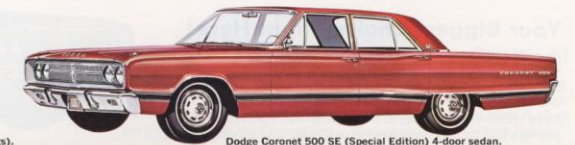
Dodge Coronet 500 SE (Special Edition) 4-door sedan.