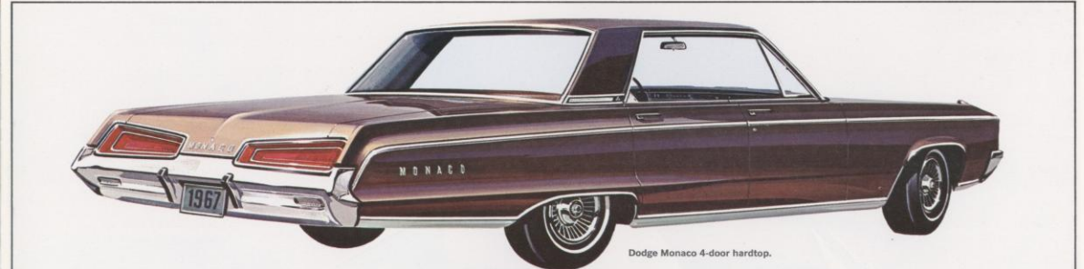
Dodge Monaco 4-door hardtop.