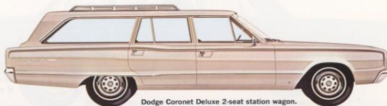
Dodge Coronet Deluxe 2-seat station wagon.

Is this your year for a wagon? Your year to break the old sedan-buying habit? Then Coronet wagons are for you! Dodge built them big enough to haul just about anything — yet trim and thrifty enough to fit in everywhere (even into your budget). Four new '67 Coronet wagon models: Two Coronet 440s (a 2-seat and a 3-seat model), and 2-seat Coronet Deluxe Wagon — and the thriest Dodge wagon for all for '67 — the new Coronet Series station wagon!