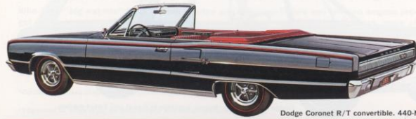
Dodge Coronet R/T convertible. 440-Magnum V8 is standard.