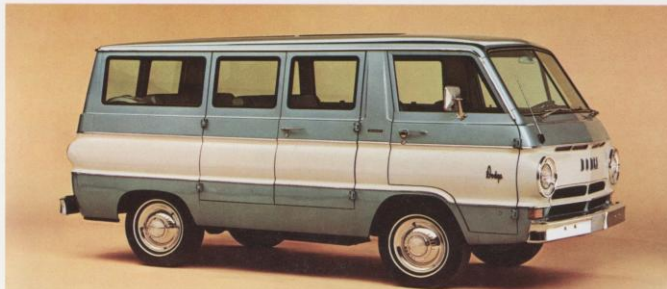
Dodge Custom Sportsman on 90-inch wheelbase.

Both wagons, 90" and 108" wheelbases, are offered as luxurious Custom Sportsman (shown here) and lower priced, conventional Sportsman models.