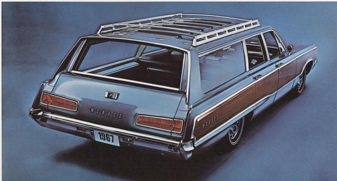
Dodge Monaco station wagon, finest in our line, available in 2-seat and 3-seat models.

**Optional at extra cost, on both Polara and Monaco station wagons.