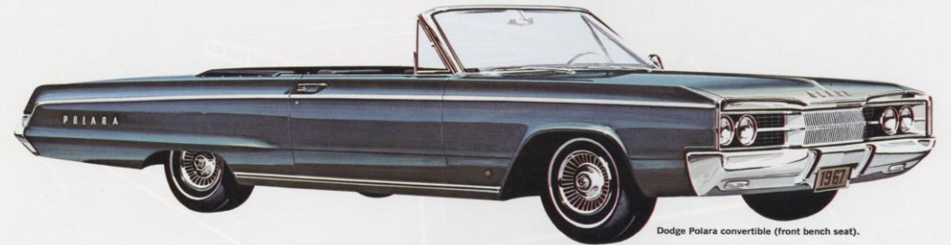
Dodge Polara convertible (front bench seat).