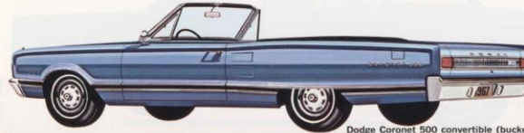
Dodge Coronet 500 convertible (bucket seats).