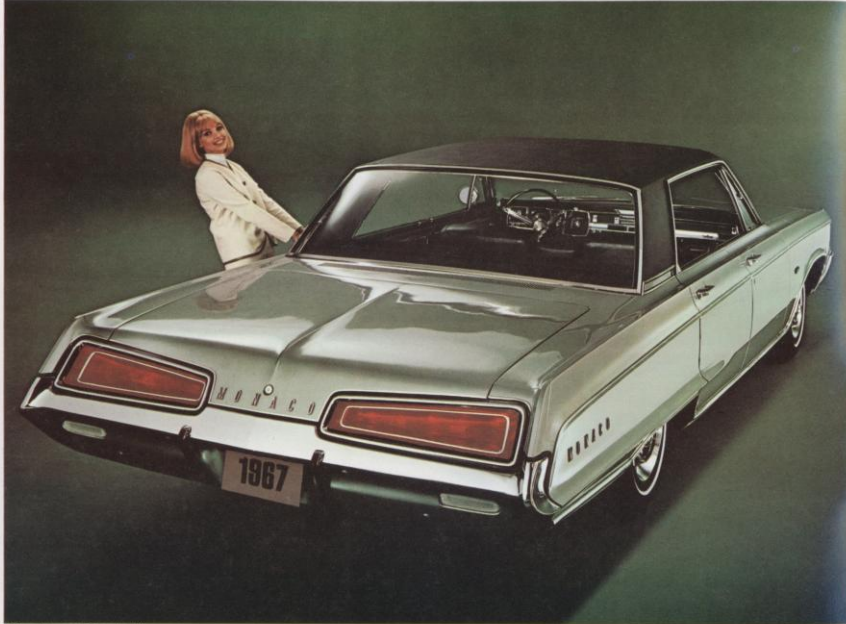
Dodge Monaco 4-door hardtop.