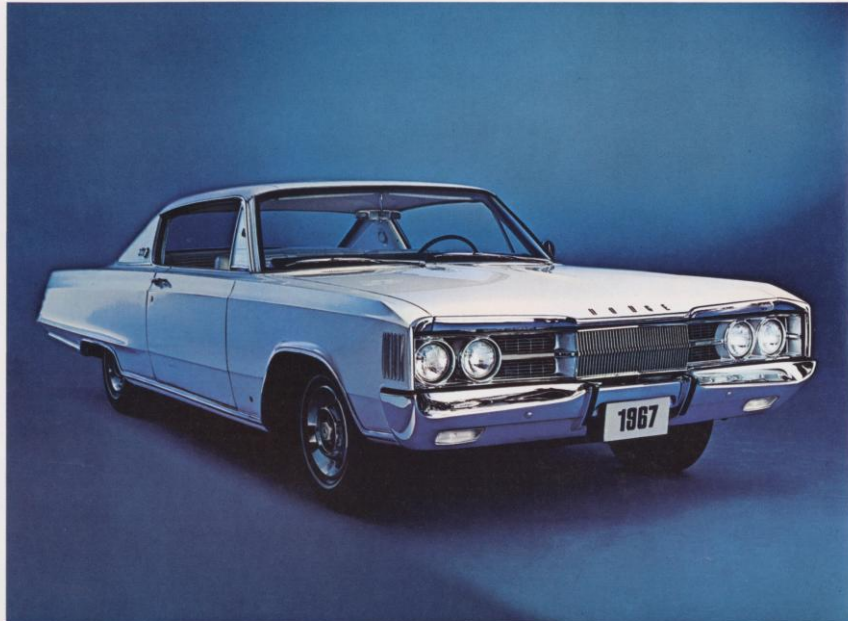
Dodge Polara 500 2-door hardtop.