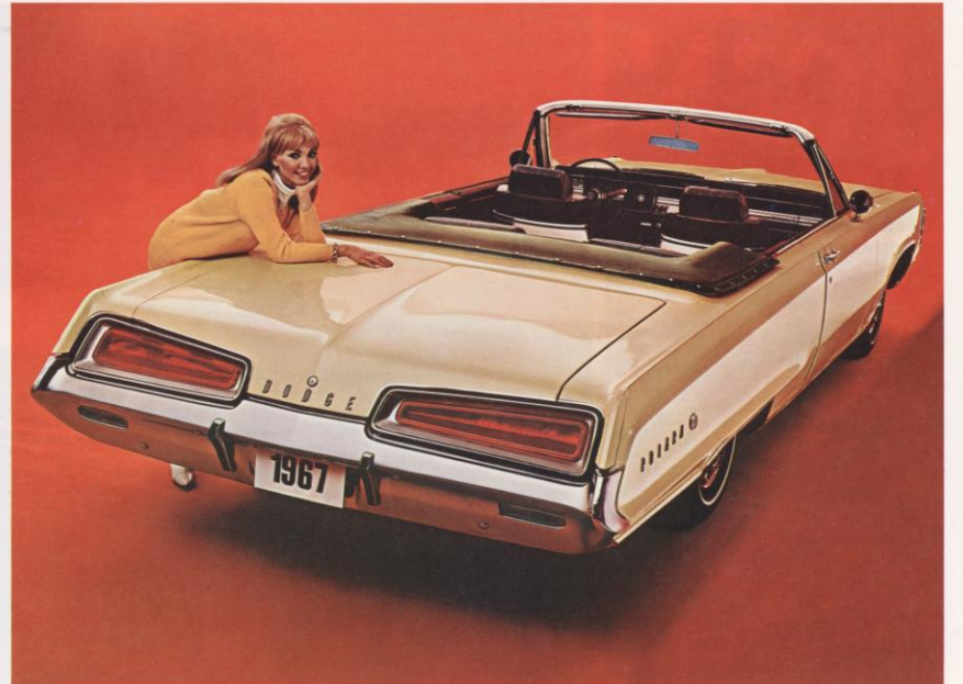
Dodge Polara 500 convertible — finest softtop in the Dodge line for '67.