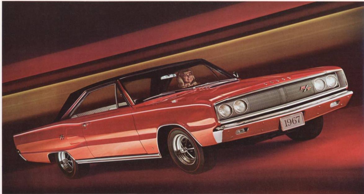
Dodge Coronet R/T 2-door hardtop. 440-Magnum V8 is standard.

*Dodge 426 Hemi V8, with dual 4-barrel carbs, available as an optional engine choice, at extra cost.