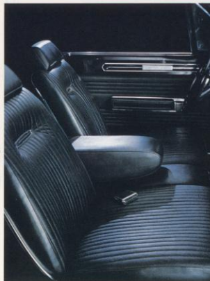
All-vinyl Coronet 500 interior.