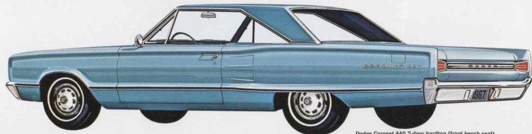
Dodge Coronet 440 2-door hardtop (front bench seat).

For a look at Coronet 440 station wagons (2-seat and 3-seat models), please turn the page.