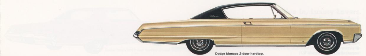
Dodge Monaco 2-door hardtop.