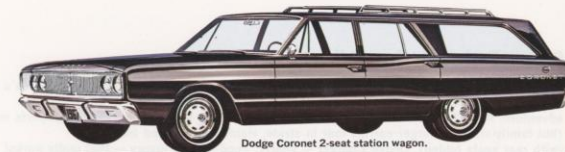
Dodge Coronet 2-seat station wagon.