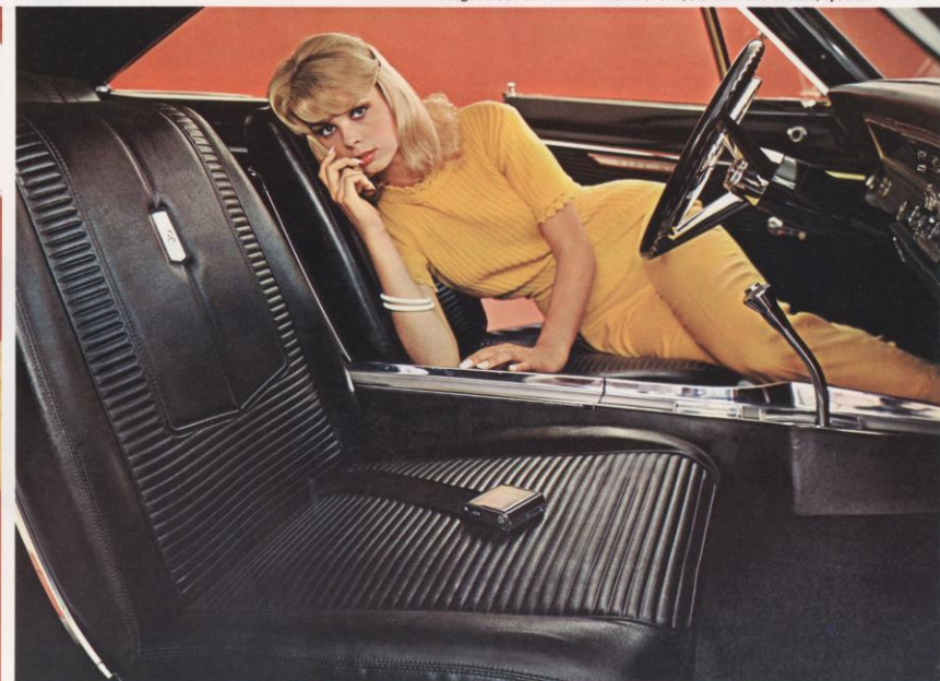
Dart GT all-vinyl interior. Bucket seats are standard in GT hardtop, optional (at extra cost) in GT convertible. Center console is an extra-cost option on both GT models.