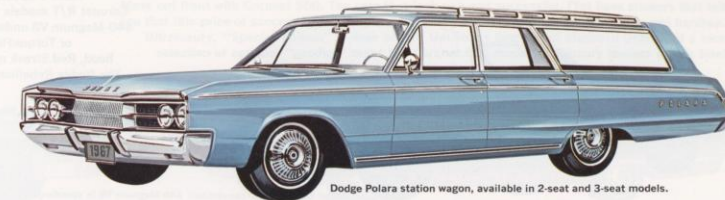
Dodge Polara station wagon, available in 2-seat and 3-seat models.

**Optional at extra cost, on both Polara and Monaco station wagons.