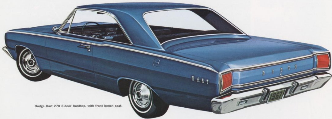
Dodge Dart 270 2-door hardtop, with front bench seat.