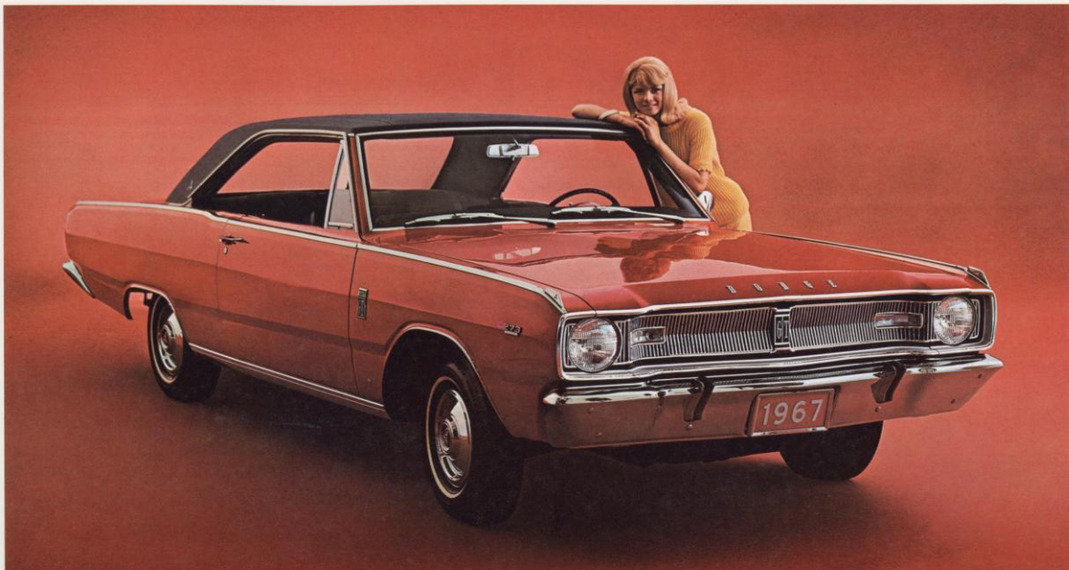
Dodge Dart GT 2-door hardtop. Front bucket seats are standard.

Lots of people are. That's why Dart — the Dodge-sized compact — gives you instant relief from compacts that are too small. But Dart gives you a lot more. For '67, Dart's strategy is to dazzle you with good looks. It's brand-new. Completely restyled — inside and out. Lots of pleasant surprises when it comes to room, comfort and extras that are all included in Dart's familiar compact-car price.