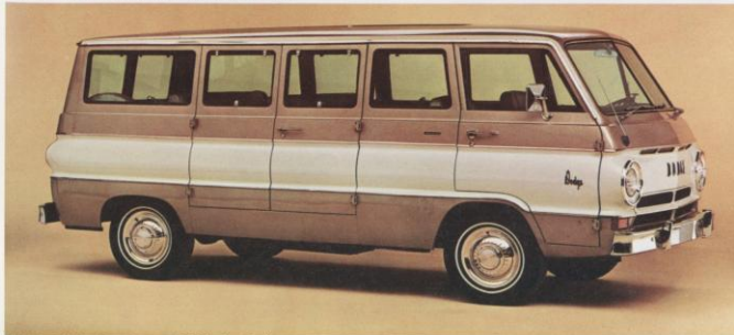
Dodge Custom Sportsman on 108-inch wheelbase.