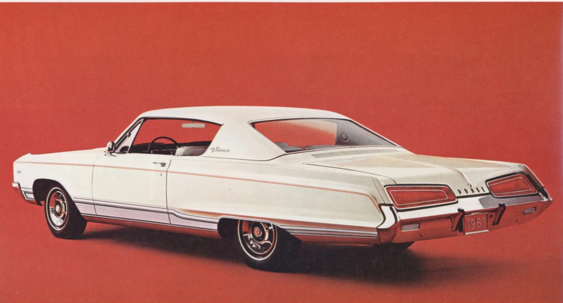
Dodge Monaco 500 — the most luxurious Dodge ever built!

... from every other car (and every other Dodge) for '67. Unfortunately there can only be one top luxury car in any model line. Fortunately, for you, Dodge offers Monaco 500. Even if you bought it "stripped," Monaco 500 would still come equipped with more standard features than just about any other car on the road. One look is all you need — to know that Monaco 500 is our top-echelon command car for Operation '67!