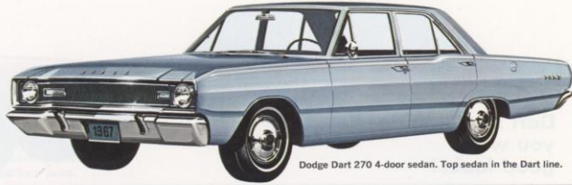
Dodge Dart 270 4-door sedan. Top sedan in the Dart line.

Stand up for your rights. Get a car with more fun inside, more run under the hood, and the familiar compact price on the sticker. Get all this — plus extra "knee-room" (instead of "no-room"), man-sized seats, rugs on the floor, and brand-new styling. Get one of the Dart 270 models for '67. A sporty hardtop or a 4-door sedan. They're just about the most value-packed cars you can find anywhere.