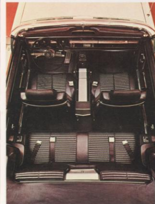
Polara 500 interior (all-vinyl).