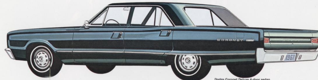
Dodge Coronet Deluxe 4-door sedan.

That's right behind the wheel of a '67 Coronet. Then prepare for an invasion by friends who snap to attention when they find out you have a new car that makes the other '67s suddenly seem drab. If you want Coronet's long, smooth styling—Coronet's room and handling — and you want it all at the lowest price in the Coronet line — the password is "Coronet Deluxe."