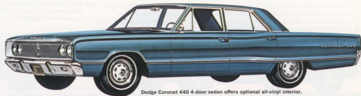
Dodge Coronet 440 4-door sedan offers optional all-vinyl interior.

Coronet 440 offers you the biggest incentive to sign up for a tour with Dodge. Sedan? Hardtop? Convertible? Station wagons (2-seat and 3-seat models)? The Coronet 440 Series has 'em all. Check the man-sized quarters inside these rebellious new Dodges. Every model has full-dress interiors that include foam-padded seats and full carpeting.