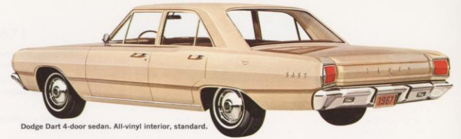
Dodge Dart 4-door sedan. All-vinyl interior, standard.

If you're looking for fresh Dart styling and Dart-sized room, at the lowest prices of all, here they are: The Dart Series. A 2-door and a 4-door sedan. The best of everything the Dodge Rebellion stands for — at prices to fit nearly any budget.