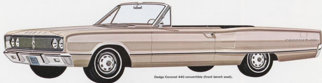
Dodge Coronet 440 convertible (front bench seat).