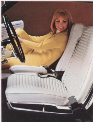
Polara 500 all-vinyl interior.