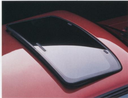
The hatchback's flip-up open-air roof option lets the outside in with one quick flip.