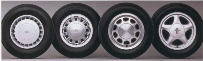
Left to right: finned wheel cover; styled road wheel; cast aluminum wheel; 5-spoke cast aluminum wheel.