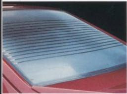
The rear window defroster is a popular and practical option.