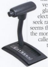
For those who prefer a less active style of motoring, both of the Mustang engines can be teamed with the optional automatic overdrive transmission.