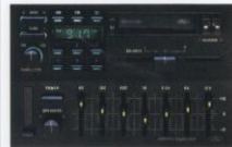
The optional 7-band graphic equalizer fine tunes specific frequency ranges.