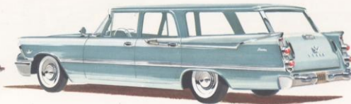
Custom Sierra 6-Passenger Station Wagon

It won't take you long to discover the advantages of the exclusive Dodge Observation Lounge. First, there's plenty of room for three man-sized adults with loads of comfort, too. Roomier than old fashioned third seats. Second, your third seat passengers get an unobstructed view and all the fresh air they want through the big power-operated rear window. And third, there's no squirming past the second seat to get in — passengers enter easily from the rear. Standard on all nine passenger models.