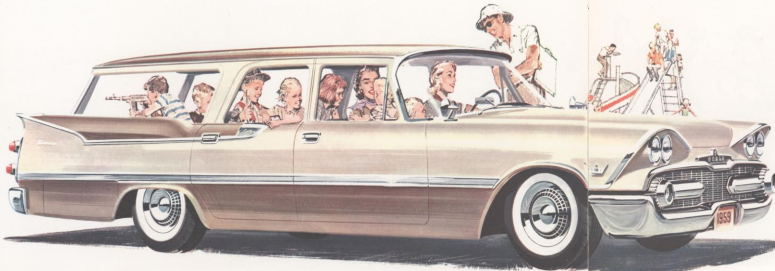
Custom Sierra 9-Passenger Station Wagon with Observation Lounge