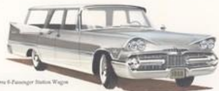
Sierra 6-Passenger Station Wagon