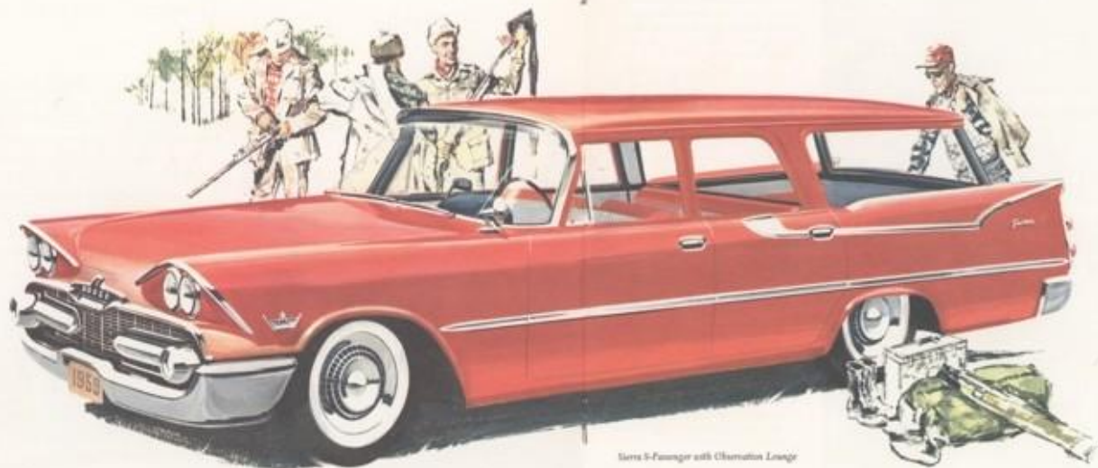
Sierra 5-Passenger with Overstation Lounge

If you're a feature-conscious buyer with an eye for value, the Dodge Sierra is made to order for you. Both six and nine passenger models come fully equipped with the most wanted driving advances on the road. The famous smoothness and control of Dodge Tension-Air Ride. The easy luxury of push-button driving. The added safety of Dodge Total-Contact Brakes. And the confident response of the new Dodge Ram-Fin engine. There's more than enough room for the whole family and their gear in real living room comfort. Yet, for all its quality and size, the Dodge Sierra wears a pleasing modest price tag. Any way you look at it — size, comfort, convenience, performance or price, this new Sierra is the quickest way to a practical man's heart.