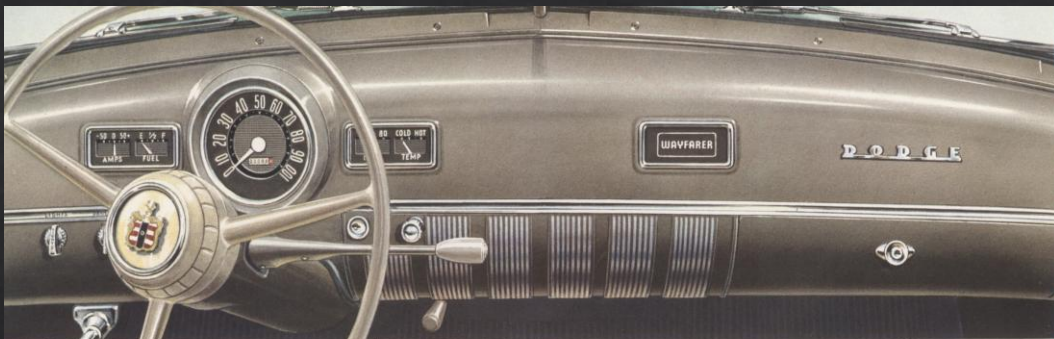
Facial point of the beautiful Dodge interiors is the ultra-smart and modern instrument panel. Dials and controls are grouped for driver's convenience . . . eyes need scarcely leave the road to read the recessed speedometer.