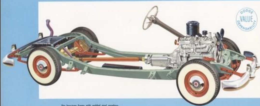
The box-type frame with welded steel members contributes greatly to the Dodge reputation for safety and long car life.

The heavy, rigid box-type frame gives an extra measure of strength and safety, while Floating Power engine mountings and thick rubber cushions at points of contact with the car body literally smother all engine vibration and road noise. Note how axles have been moved outward, eliminating excessive "overhang." This permits more space for passengers, with better riding comfort . . . but without increasing overall car length.