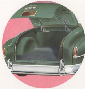
Finger-tip pressure raises or lowers the spring-balanced lid . . . uncovers an amazingly spacious trunk compartment. There is also generous and convenient storage space behind the driver's seat.