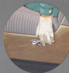
ADJUSTABLE DRIVER'S SEAT moves forward easily and quickly a full 5 inches . . . rises over 1 inch, too, for better, safer visibility for shorter drivers.