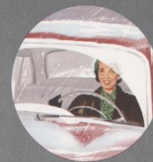
ELECTRIC WINDSHIELD WIPERS, standard equipment on all models, operate smoothly, quietly at constant speed for clear-view visibility in heaviest downpours.