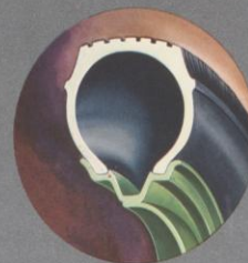
SAFETY-RIM WHEELS—Famous blow-out safety feature holds deflated tire in place on wheel for safe stops under complete driver control.