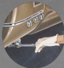
NEW CANE-TYPE LEVER on parking brake. Sets brake easily with minimum effort to hold car on any grade . . . needs just a twist to release.