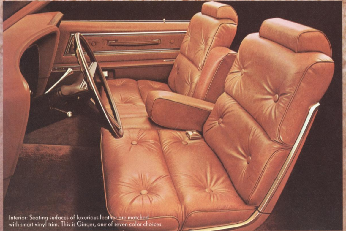
Interior: Seating surfaces of luxurious leather are matched with smart vinyl trim. This is Ginger, one of seven color choices.