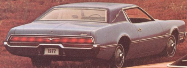
Exterior: Medium Blue Metallic.