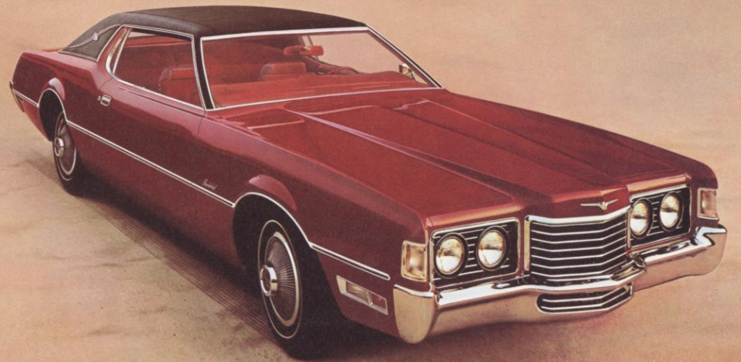
The 1972 Thunderbird Hardtop. Exterior: Maroon.