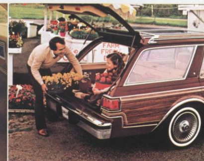
DIPLOMAT'S LIFTGATE OPENS WIDE TO PROVIDE A BIG ENTRYWAY TO ITS 73.3 CUBIC-FOOT CARGO AREA.