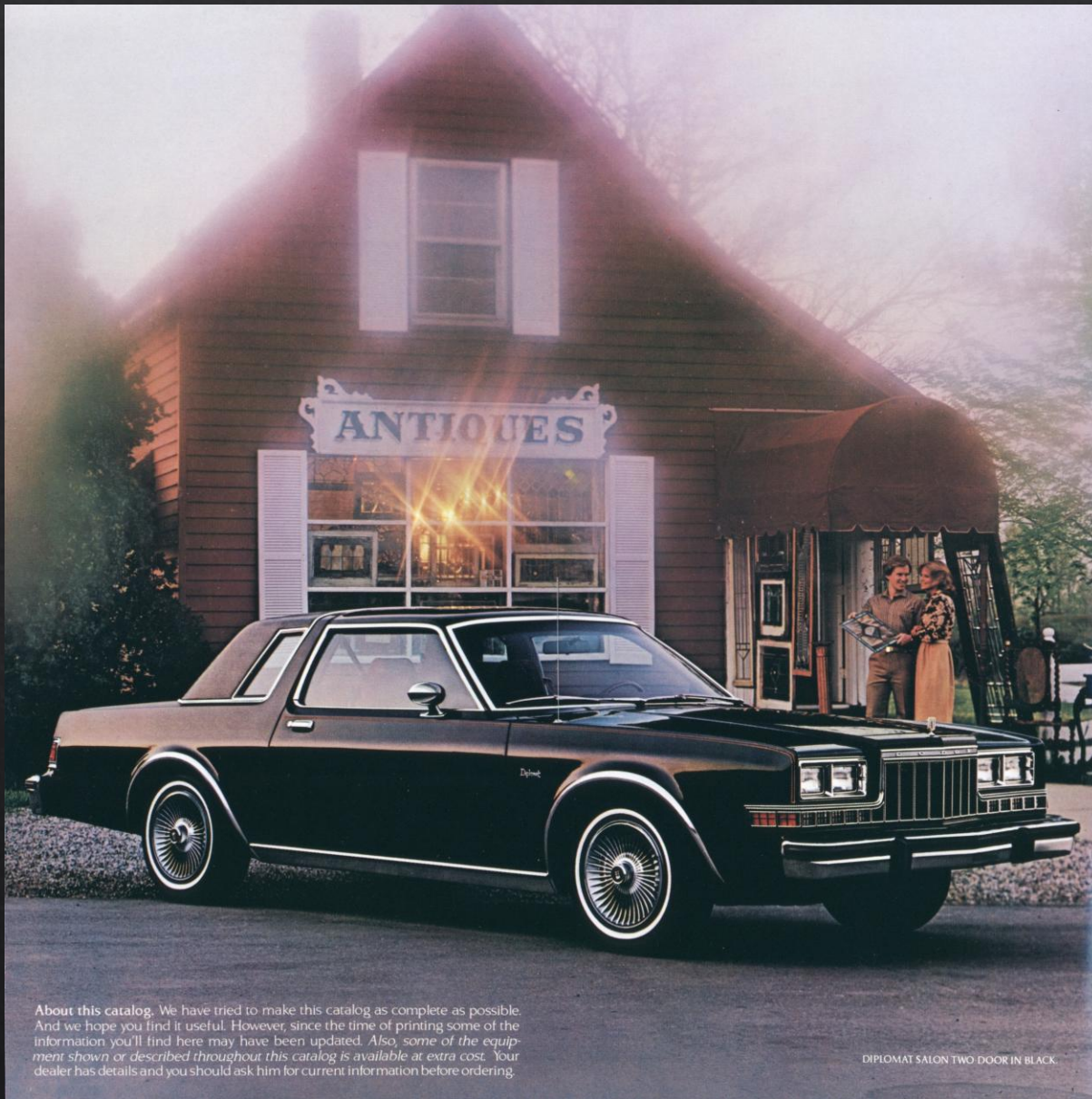
DIPLOMAT SALON TWO DOOR IN BLACK.

About this catalog. We have tried to make this catalog as complete as possible. And we hope you find it useful. However, since the time of printing some of the information you'll find here may have been updated. Also, some of the equipment shown or described throughout this catalog is available at extra cost. Your dealer has details and you should ask him for current information before ordering.