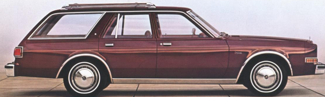
DIPLOMAT WAGON SHOWN IN BARON RED.