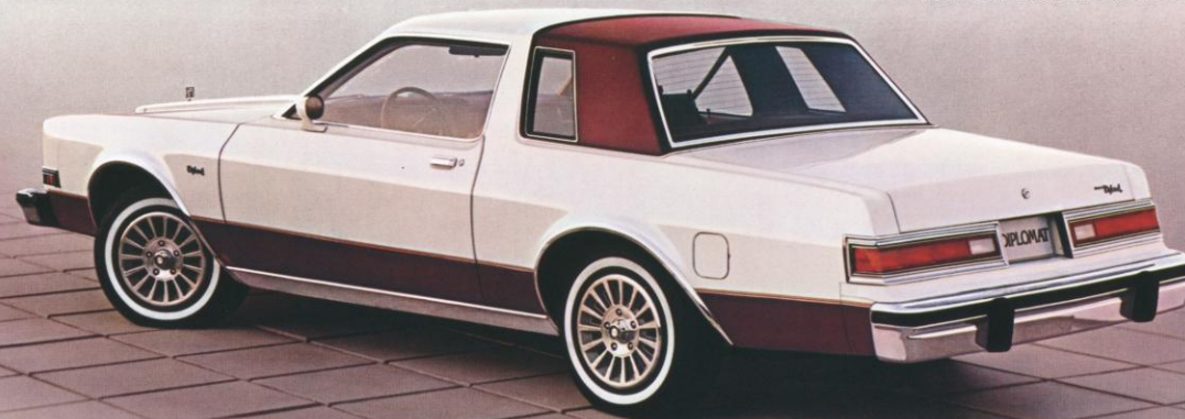
DIPLOMAT SPORT COUPE IN PEARL WHITE/BARON RED.

About this catalog. We have tried to make this catalog as complete as possible. And we hope you find it useful. However, since the time of printing some of the information you'll find here may have been updated. Also, some of the equipment shown or described throughout this catalog is available at extra cost. Your dealer has details and you should ask him for current information before ordering.