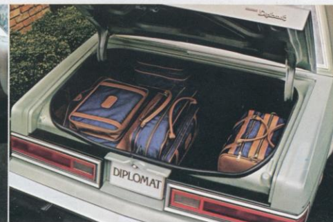
DIPLOMAT'S TRUNK OFFERS 15.6 CUBIC FEET OF CARGO SPACE.