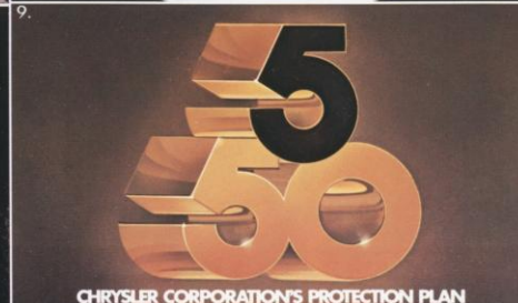
CHRYSLER CORPORATION'S PROTECTION PLAN

EXTENSIVE USE OF GALVANIZED SHEET METAL FOR CORROSION PROTECTION.