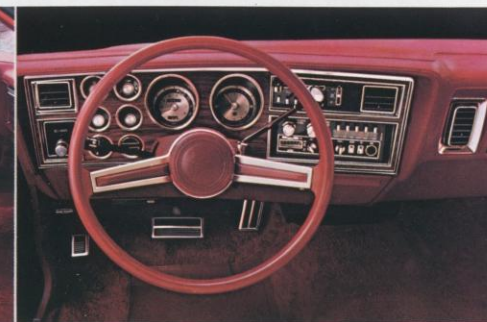
DIPLOMAT SPORT COUPE'S STANDARD INSTRUMENT PANEL WITH STANDARD TWO-SPOKE STEERING WHEEL SHOWN WITH OPTIONAL AM/FM STEREO RADIO WITH CB AND AIR CONDITIONING.