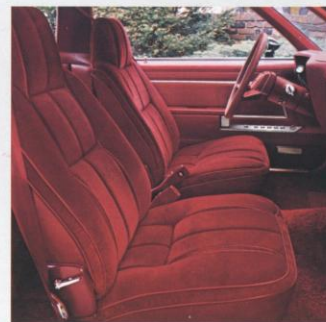
DIPLOMAT SALON'S OPTIONAL HIGH-BACK BUCKET SEAT INTERIOR, SHOWN HERE IN RED CLOTH.

You'll notice the smooth-shifting TorqueFlite wide-ratio automatic transmission and how well it works with the standard power steering, power brakes and radial tires to make Diplomat perform and handle like the quality mid-size car that it is. In fact, The New Chrysler Corporation is so sure of Diplomat's quality engineering and construction, it offers a 30-Day/1,000-Mile (whichever comes first) Satisfaction Money-Back Guarantee that's available at many dealers. See page 12 of this catalog for full details.