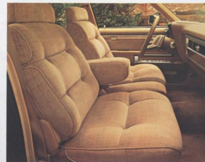
DIPLOMAT SALON WAGON OPTIONAL CLOTH-AND-VINYL 60/40 SEAT WITH FOLDING ARMREST SHOWN IN CASHMERE.

You expect a wagon to be a worker. And work this wagon does. It was built for it. Under the watchful eye of Dodge's tough quality control program. Diplomat Wagons - all Diplomats, for that matter - are selected at random as they come off the assembly line or as they wait to be shipped. They're checked for fit, function and appearance ... before they are delivered to dealers or customers. If they don't make the grade, they're sent back. It's as simple as that. That's the only way to ensure a well-built, quality car. And that's the way Dodge builds its Diplomats. Every one is shown the special attention it deserves.