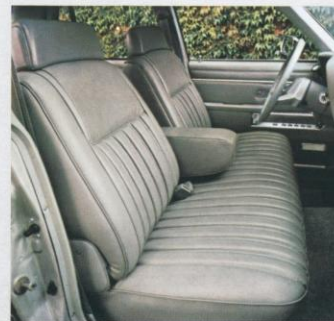
OPTIONAL VINYL BENCH SEAT WITH FOLDING CENTER ARMREST. OFFERED IN GREEN, RED, CASHMERE.

It all adds up to an admirable combination of engineering and assembly that reflects the quality inherent in Diplomat's basic design. Sensible? Very much so. But then Dodge...and you...wouldn't have it any other way.