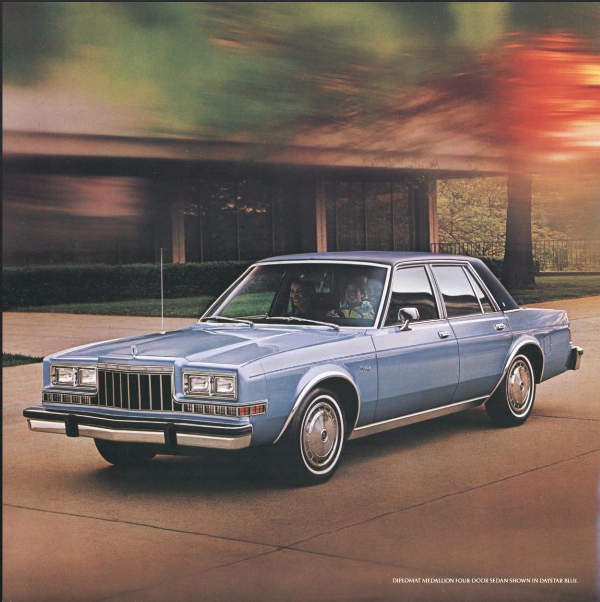
DIPLOMAT MEDALLION FOUR-DOOR SEDAN SHOWN IN DAYSTAR BLUE.