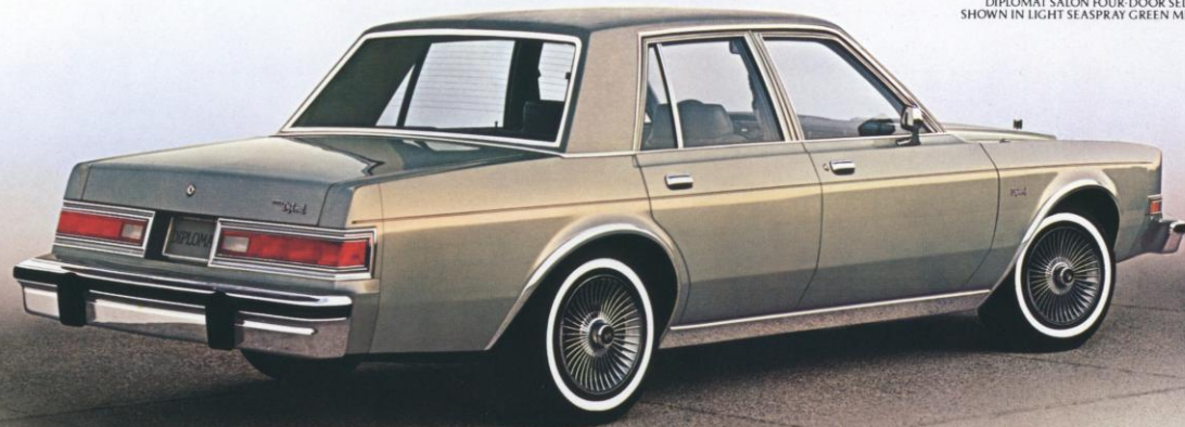
DIPLOMAT SALON FOUR-DOOR SEDAN SHOWN IN LIGHT SEASPRAY GREEN METALLIC.