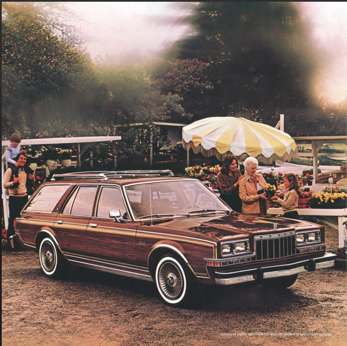
DIPLOMAT SALON WAGON SHOWN IN SPICE TAN STARSMIST