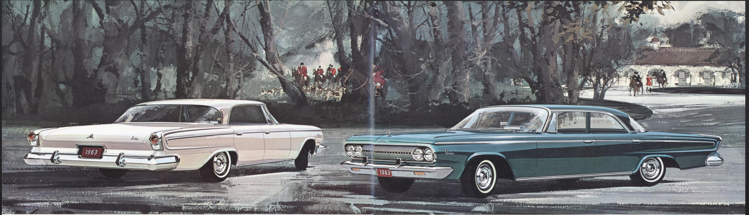
CUSTOM 880 4-DOOR HARDTOP