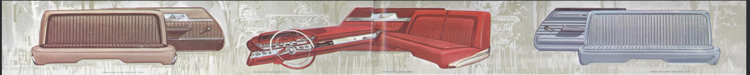
CUSTOM 880 CLOTH AND VINYL TRIM