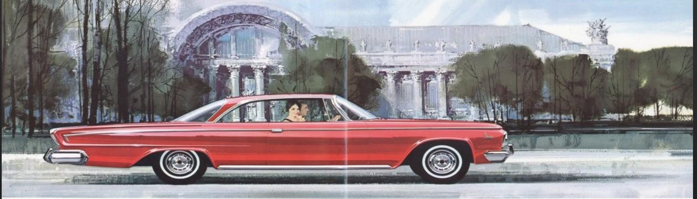
DODGE CUSTOM 880 SERIES. 1963 Custom 880 is a very large automobile . . . a luxurious, carefully crafted automobile that offers the comfort and sense of well-being that only a large car can give you.