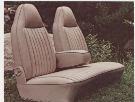
Scamp optional, cloth-and-vinyl, split-back bench seat with pull-down center armrest. Colors: blue, green, black, or parchment.