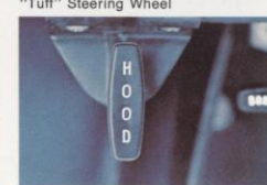
Inside Hood Release