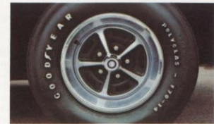
Rallye Road Wheels