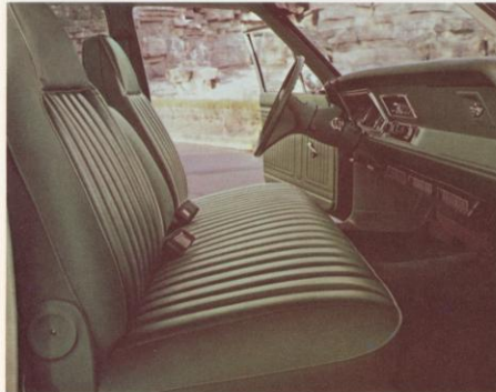
Valiant optional, all-vinyl, split-back bench seat with pull-down center armrest. Colors: blue, green, black or parchment.