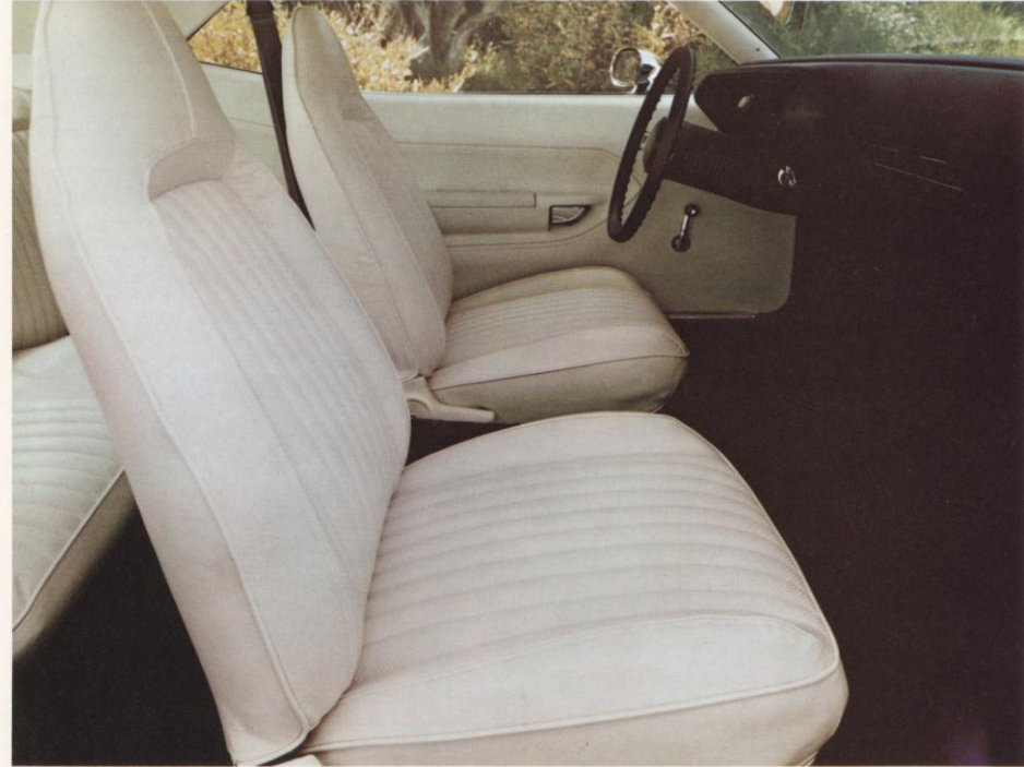
Barracuda and 'Cuda Interior

These three options are illustrated at the bottom of this page. For an illustration of what a 'Cuda or Barracuda can do for your life, ask your dealer for a test drive.