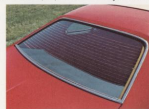
Electric Rear-window Defroster

"Tuff" Steering Wheel. For those who want a better grip on their Valiants and Dusters.