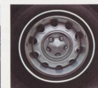
Rallye Road Wheels & Steel-belted, Radial-ply Tires