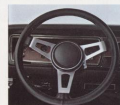
"Tuff" Steering Wheel