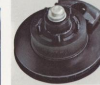
Power Front Disc Brakes

Radial-ply Tires. You can order these two options together or separately. Power Front Disc Brakes. Standard on the Duster 360 and 'Cuda.