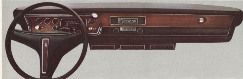
Standard Scamp Instrument Panel—Optional on Duster and Valiant

Other options to consider include air conditioning, power steering and a light package. A comprehensive options list is on pages 10 and 11.