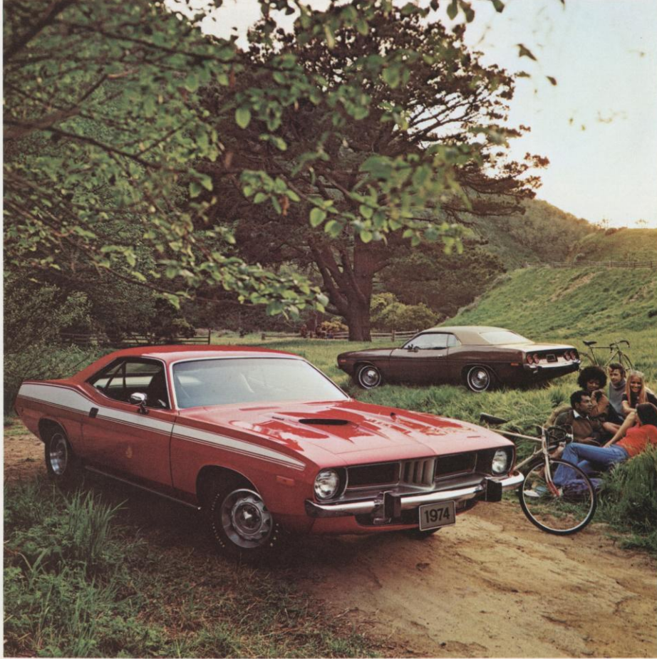
Foreground: 'Cuda Background: Barracuda

The "standards" and the "extras" are all there. Your only problem is to decide which model—'Cuda or Barracuda—best suits your lifestyle.