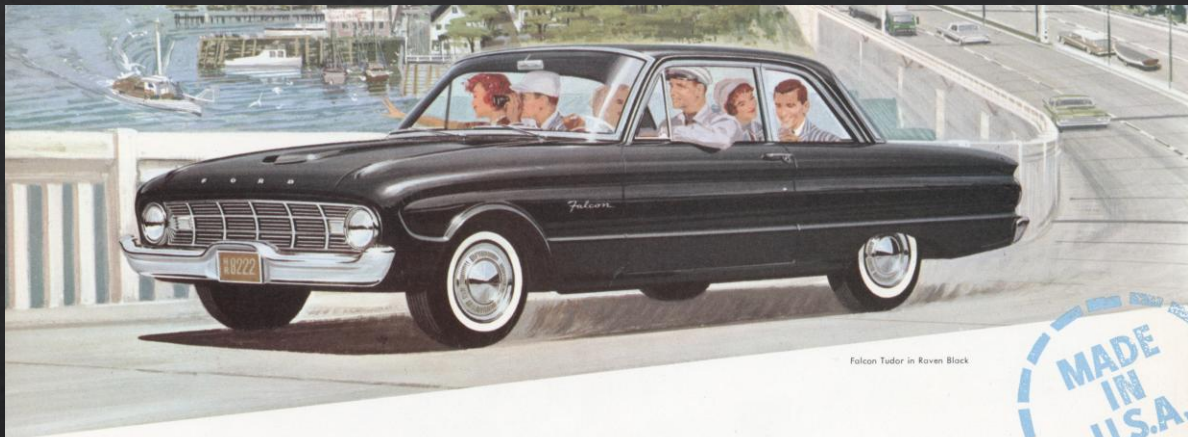
Falcon Tudor in Raven Black