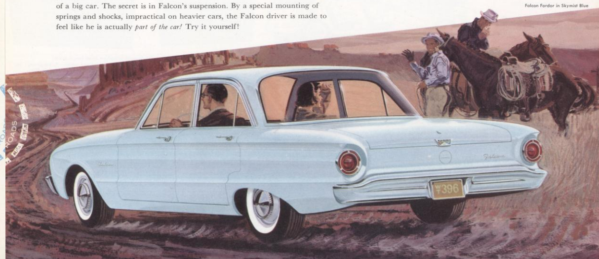
Falcon Fordor in Skymist Blue

Prepare for the biggest surprise of your automotive life the very first time you drive a Falcon. For here is a car that accomplishes the "impossible" — gives you the handling and agility of a sports car ... and the ride and comfort of a big car. The secret is in Falcon's suspension. By a special mounting of springs and shocks, impractical on heavier cars, the Falcon driver is made to feel like he is actually part of the car! Try it yourself!