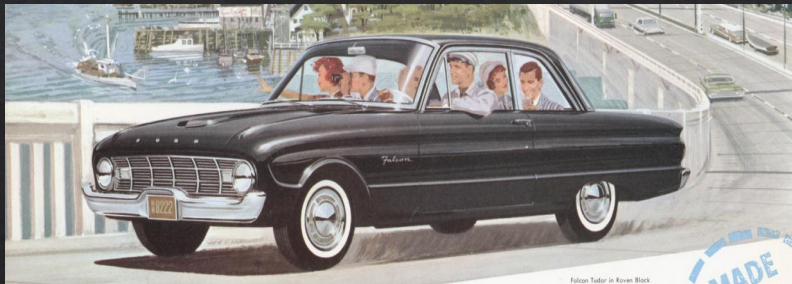
Falcon Tudor in Raven Black