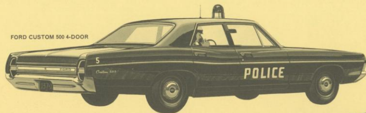
FORD CUSTOM 500 4-DOOR