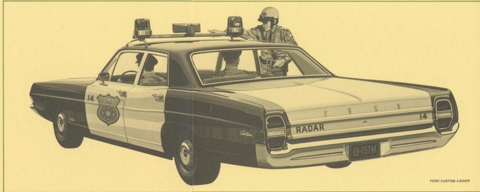
FORD CUSTOM 4-DOOR